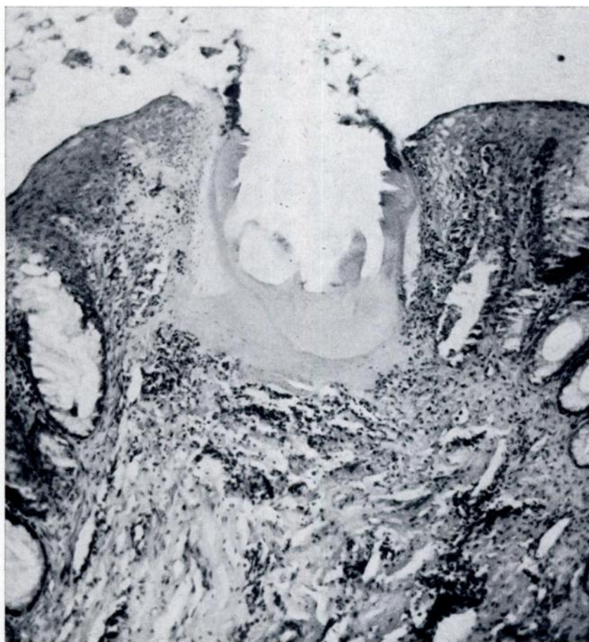
FIGURE 3. Proventriculus of a white pelican. Hyaline material formed around Contracaecum sp. has been surrounded by necrotic debris and inflammatory cells in the mucosa. H & E stain, x 50.

border was yellow, the periphery was light orange-pink, and the worm was a yellowish pink. With Mallory Crossman stain, 2 the hyaline material was dark red to red-orange, with some bluish staining material. In trichrome Pollak stain, 17 it was greenish, similar to collagen and reticulum. It was negative for iron in Perls' stain. 4 There was no reaction in Gram-Weigert stain. 10 It was greenish in Gordon Sweet stain, 10 negative for DNA in the inner portion in Feulgen stain, 4 and negative for RNA and DNA in methyl green pyronine stain. 4