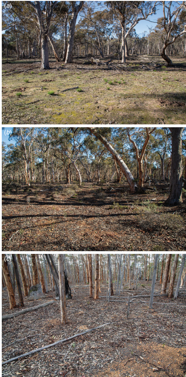
Fig. 2. The three woodland types surveyed at Dryandra: (a) E. wandoo woodland; (b) powderbark wandoo woodland; (c) brown mallet plantation. Note the different tree habits and ground vegetation associated with the varying mesic and productivity qualities of the soils, with E. wandoo being the most mesic.

1977; Coates 1993). At Dryandra, the lower levels of the landscape collect the most water and nutrients and thus have the richest and most mesic soils (DEC 2011). The slope or gradient is very gentle, ranging from 1:300 to 1:500 (McArthur et al. 1977). The E. wandoo woodland sites surveyed in this study were both found on the most productive and mesic soils in association with jam wattle and the Biberkine valley floor soils (DEC 2011). These low-lying contours can be viewed as almost indiscernible drainage lines on gentle gradients, which