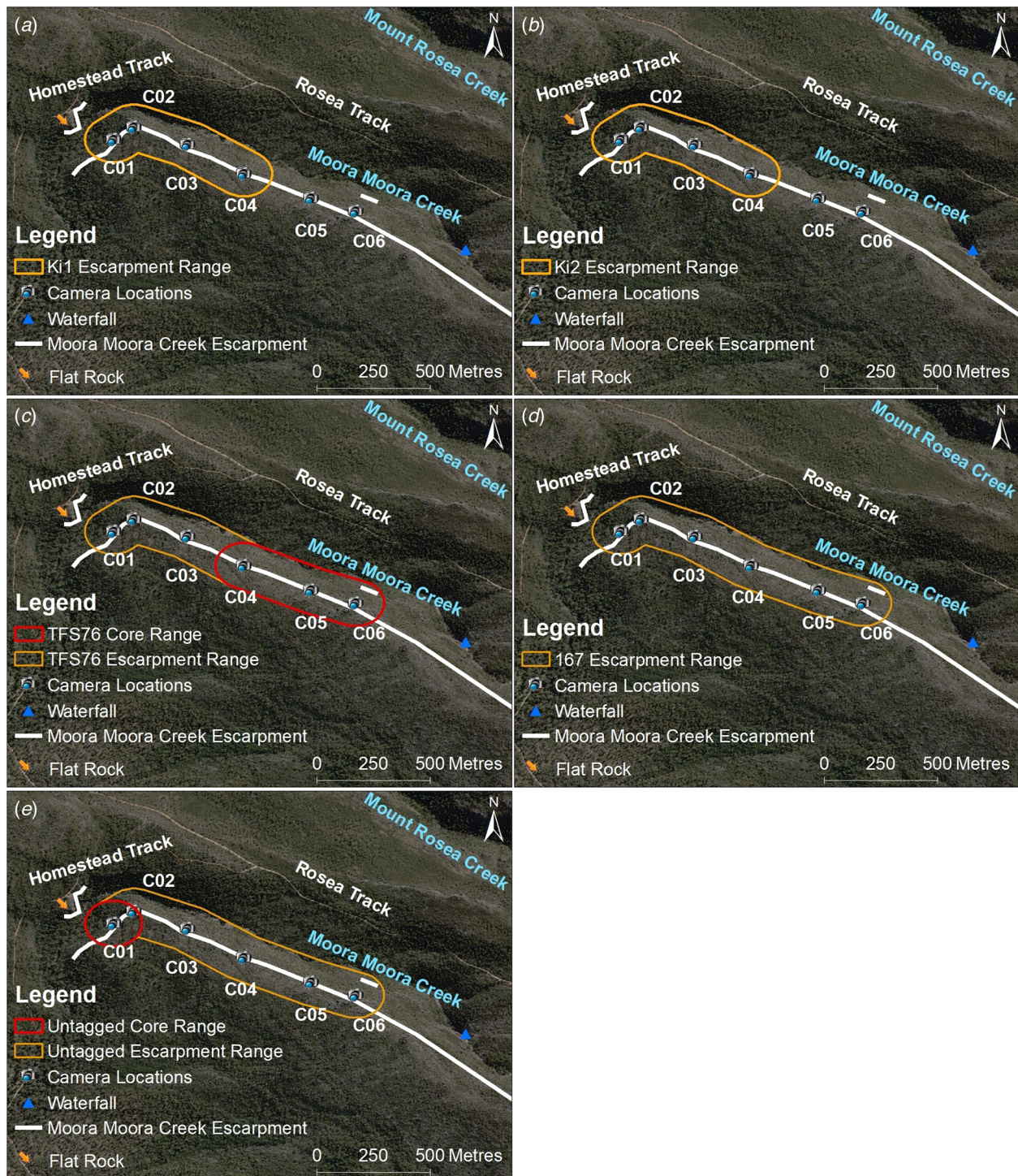
Fig. 2. Satellite image of the brush-tailed rock-wallaby ( Petrogale penicillata ) reintroduction site at Moora Moora Creek, in the Grampians National Park, Australia. Figure shows core and entire escarpment ranges of (a) female Ki1, (b) female Ki2, (c) female TFS76, (d) male 167 and (e) untagged animal. The range estimates were taken from images captured by six remote cameras set up at the site along the escarpment. C01–C06 indicate the positions of the six remote cameras.

equilibrium test showed no significant deviation from equilibrium after Bonferroni correction and no linkage disequilibrium was present for the loci used in the study. The analysis in MICRO-CHECKER revealed no evidence of