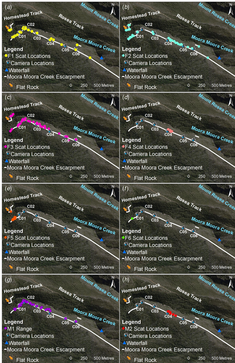
Fig. 3. Locations of brush-tailed rock-wallaby ( Petrogale penicillata ) scats of genotyped (a) female F1, (b) female F2, (c) female F3, (d) female F4, (e) female F5, (f) female F6, (g) male M1 and (h) male M2. Animals are part of the reintroduced colony in Grampians National Park, Australia. C01–C06 indicate the positions of the six remote cameras monitoring the site.