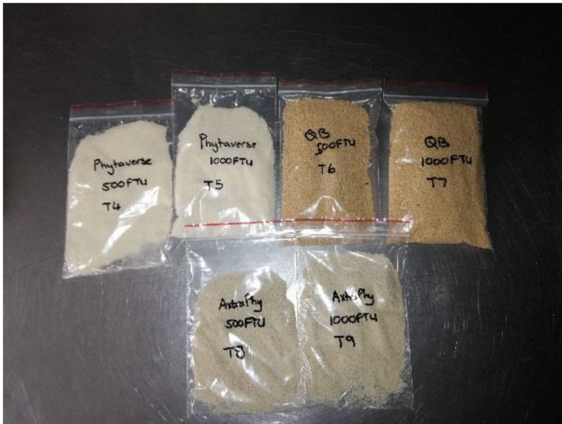
Fig. 1. Phytase enzymes that were used in the study. T4 and T5, Phytaverse (PTV), a modified E. coli phytase at 500/1000 FTU; T6 and T7, Quantum Blue (QB), an enhanced E. coli phytase at 500 and 1000 FTU; and T8 and T9, Axtra-PHY (AxP), a Buttiauxella species bacterium-sourced phytase at 500 and 1000 FTU. [Colour online.]