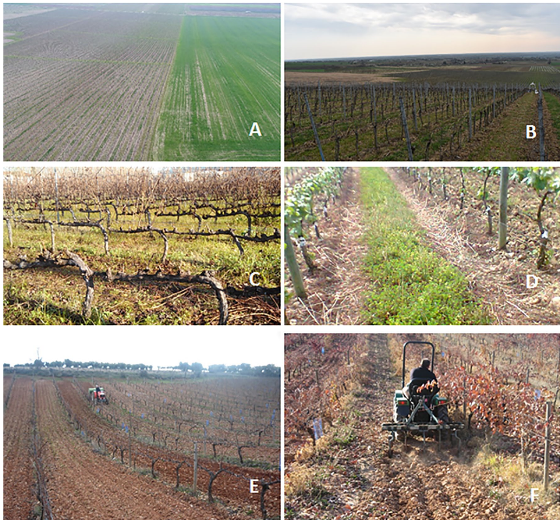
Figure 1. Panoramic overviews of all the study areas: (A and B) Vineyards in Eastern Croatia. (C and D) Vineyards in north-central Portugal. (E and F) Vineyards in Central Spain.

were the necessity to develop proper site-specific management plans to avoid water shortages and that cover crops can be recommended for soil protection in semi-arid environments. These results complete previous results obtained in other pioneer investigations conducted by this group in this region 17,18 or when compared with other European vineyards. 19