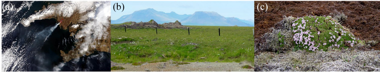
Figure 2. (a) The Myrar wildland fire on 30 March 2006 at 12:55 (image from NASA/MODIS), (b) Myrar 24 July 2006, and (c) edge of a moss fire in June 2007 (Photos: Throstur Thorsteinsson).

lowland coniferous plantations, fire damage can be significant (Szatmári et al., 2016). Human-induced fire, which is generally ignited unintentionally, is the major cause of wildland fires. Arson, for example, affects approximately 10 000 ha of grassland per year (Deak et al., 2014). Prescribed burning is scarcely applied due to legislative constraints, even though in grasslands it may present a feasible solution for several conservation challenges, for example, for increasing landscape-scale diversity, creating habitats for specialist species or for decreasing the amount of accumulated litter (Deak et al., 2014) and also for the protection of the endangered great bustard (Végvári et al., 2016).