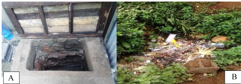
Figure 5. Sample photos of (A) substandard placenta pit and (B) open field disposal of wastes.