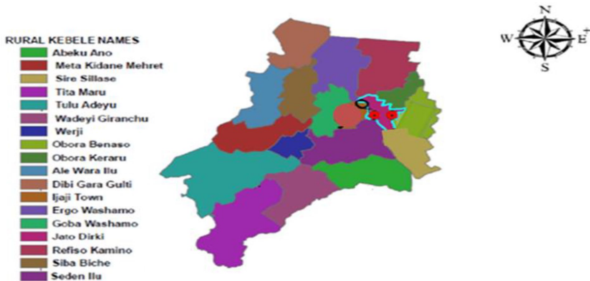
Figure 1. Map of the Ilu Galan district with sub-districts (kebeles), 2020.