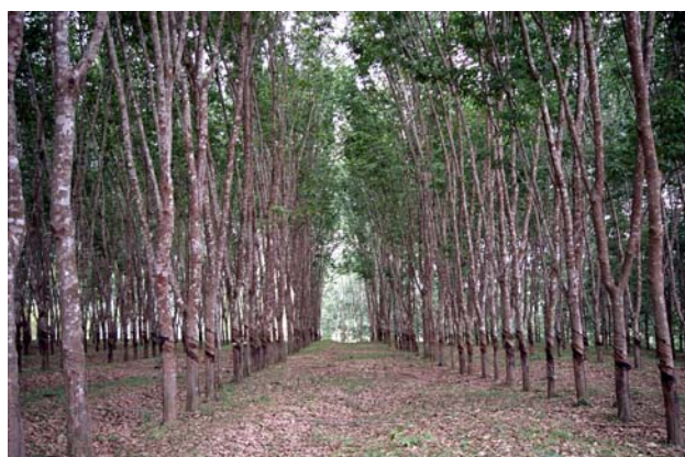
Fig. 4. Left: Village of Dai with rubber plantation behind. Right: Rubber plantation. Southern Yunnan, China