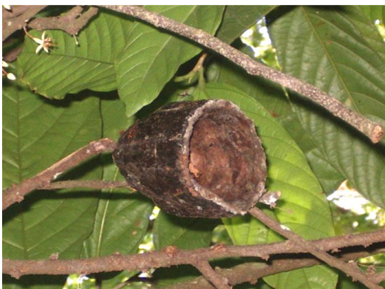
Fig. 2: Evidence of feeding by red-tailed monkeys on the pods on a cocoa tree in the plantation at Kituza Research Station, Uganda

Red-tailed monkeys in the social group ranged most frequently in plots close to the forest edge, while solitaires ranged more extensively. Hence, cocoa pods in plots near the forest edge were more damaged by social groups than those far away ( r = 0.61 , P < 0.05 , N = 12 plots). Furthermore, plots farthest from the road suffered higher damage than the corresponding plots near the road ( paired t-test = 3.675, P=0.001 ). On the other hand, adult solitary males were sighted more frequently in plots distant from the forest edge ( r = -0.828 , P < 0.001 ; N=12 plots), and consequently, the pod damage caused by solitaires increased with distance from the forest edge ( r = 0.745 , P < 0.008 ).