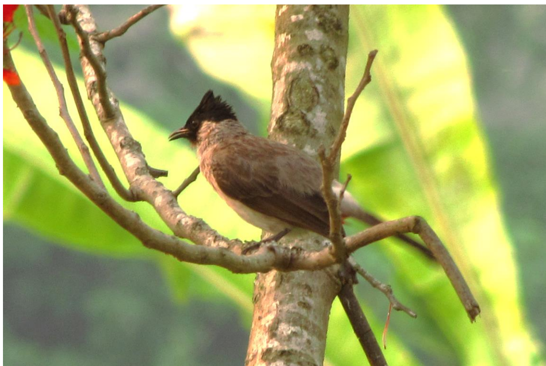
Fig. 3. Sooty-headed Bulbul ( Pycnonotus aurigaster ) at Xishuangbanna Tropical Botanical Garden (XTBG), Yunnan, China; photo credit: Rachakonda Sreekar.