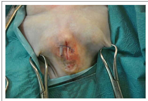
Figure 3 Vulvar stay sutures after amputation of the prolapse and replacement of the stump

The aetiology of uterine prolapse is unknown in queens. It is thought to occur as a result of decreased myometrial tone that may allow the uterus to fold in and permit part of the wall to move towards the pelvic inlet. 9