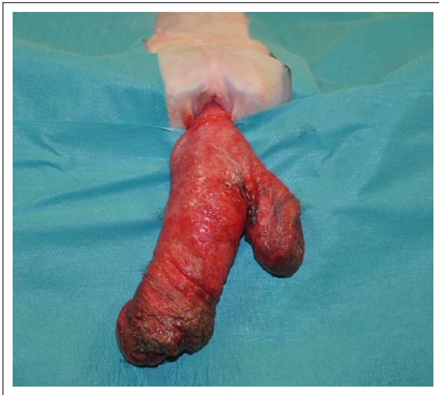
Figure 1 Prolapsed uterus after removal of debris and aseptic preparation before amputation. Note the oedema, congestion and areas of necrosis