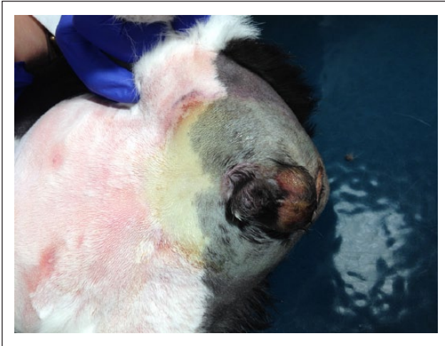
Figure 1 Day 4 post-presentation of case 1 illustrates the first indication of necrotic skin formation as seen by the yellow–gray skin discoloration that extends 5 cm cranial to the prepuce, 1 cm lateral to the scrotum and prepuce, and extends toward the lateral and caudal margins of the tail base. A tissue marker was used to outline the delineation between normal and abnormal skin for the purposes of monitoring for further progression