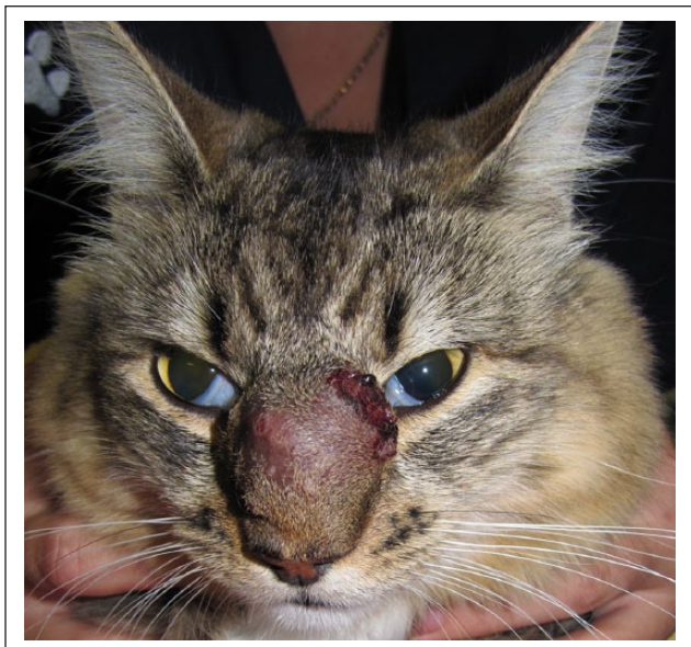
Figure 1 Large subcutaneous swelling over the nasal bridge at initial presentation

empirically with amoxicillin–clavulanate (12.5 mg/kg PO q8h for 10 days) (Amoxyclav; Apex Laboratories) and enrofloxacin (6.25 mg/kg PO q24h for 10 days) (Baytril; Bayer).