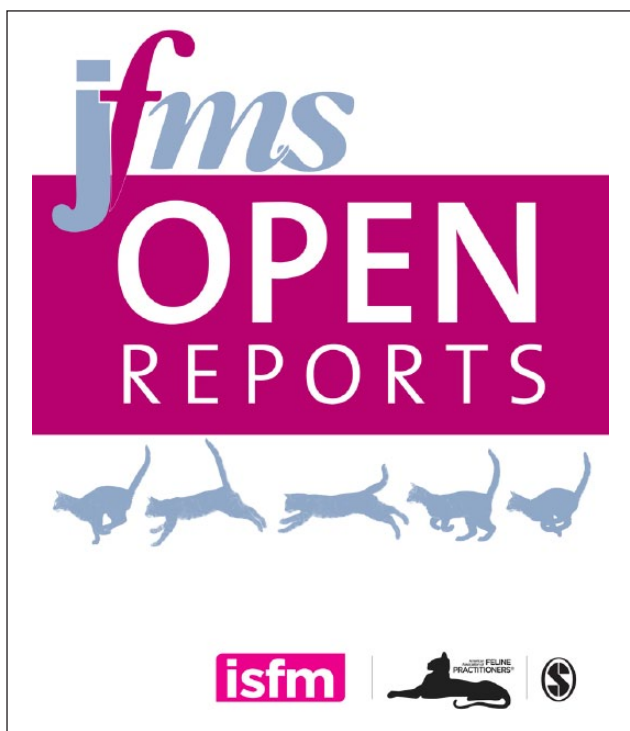
Figure 1 JFMS Open Reports underwent a successful evaluation by PubMed Central of the scientific and editorial quality of its content, as well as the technical quality of its digital files

Indexing in PubMed Central is a quality acknowledgement: a guarantee that the research we publish is of a high standard.