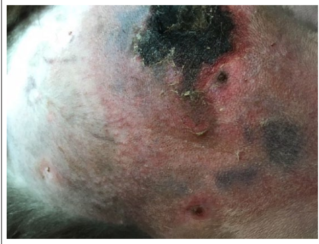
Figure 2 Case 2: this image depicts the necrotic eschar which became apparent on day 5

discomfort. There were also multiple small raised nodules surrounding the central necrotic area, and crusting papules and nodules around the head and neck (Figure 3). Buprenorphine was administered (Vetergesic [Ceva] 20 µg/kg IV q8h) to provide analgesia.