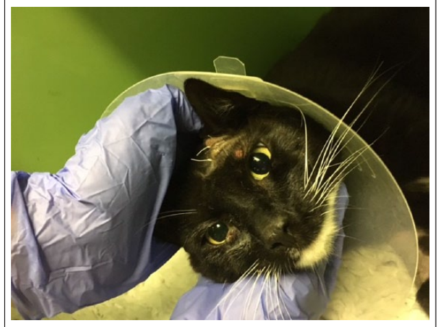
Figure 3 Case 2: this image depicts the lesions noted on the head, which are typical of cowpox virus dermatopathy. As some of these had been biopsied prior to the photograph having been taken, there are sutures present

The cat re-presented on day 12, with its appetite having reduced, resulting in difficulty administering oral medications. The cat was lethargic again. The cat was given intravenous rFeIFN- \omega (as above) for a further 3 days. However, by day 14, de novo nodular lesions had developed on the neck, head and thoracic limbs. The ventrally necrotic region began expanding in size and the small raised papules were becoming more evident