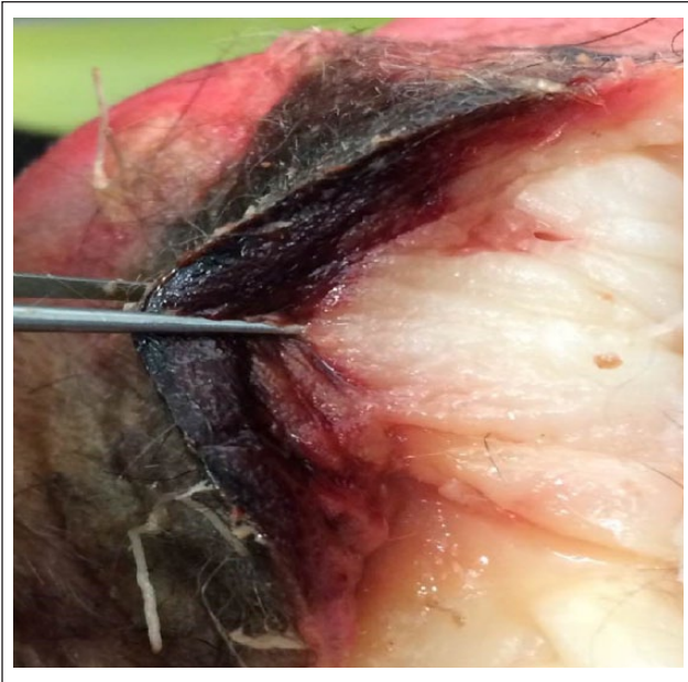
Figure 4 Case 2: image obtained post mortem demonstrating the full extent of the eschar, extending the entire layer of the dermis