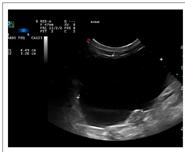
Figure 1 Ultrasonographic image of the hepatic cyst (4.5 cm × 3 cm)

Abdominal ultrasonography revealed that the hepatic cyst located in the left side of the liver had increased in size, measured 4.5 cm × 3 cm, and was causing a partial obstruction of the bile duct, which measuring around 3 mm in diameter (Figure 1). The second hepatic cyst had not increased in size. No other causes of cranial abdominal pain were found from the blood results or ultrasound study. Owing to the enlargement of the hepatic cyst and developing clinical signs,