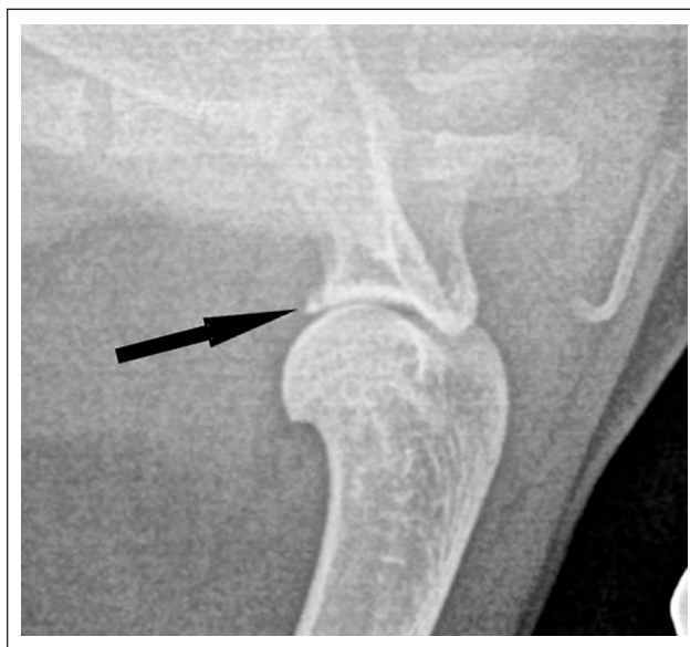
Figure 2 Radiography of the left glenohumeral joint with an ununited caudal glenoid (arrow)

The UCG was embedded in, and connected to, the glenoid with fibrous tissue. It consisted of necrotic bone with a characteristic yellow crumbly appearance. It was unstable on gentle probing.