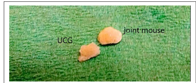
Figure 5 Ununited caudal glenoid with joint mouse attached, after resection and removal

In dogs, UCG can be seen on plain radiography. Only a presumptive diagnosis can be made on the basis of clinical examination and radiographic screening, as UCG can be an incidental finding. 3 Other possible causes of lameness should be excluded and further diagnostics should be made to diagnose UCG as the cause of lameness. Further diagnostics that have been described in dogs are nuclear scintigraphy, arthrography or arthroscopy. 1