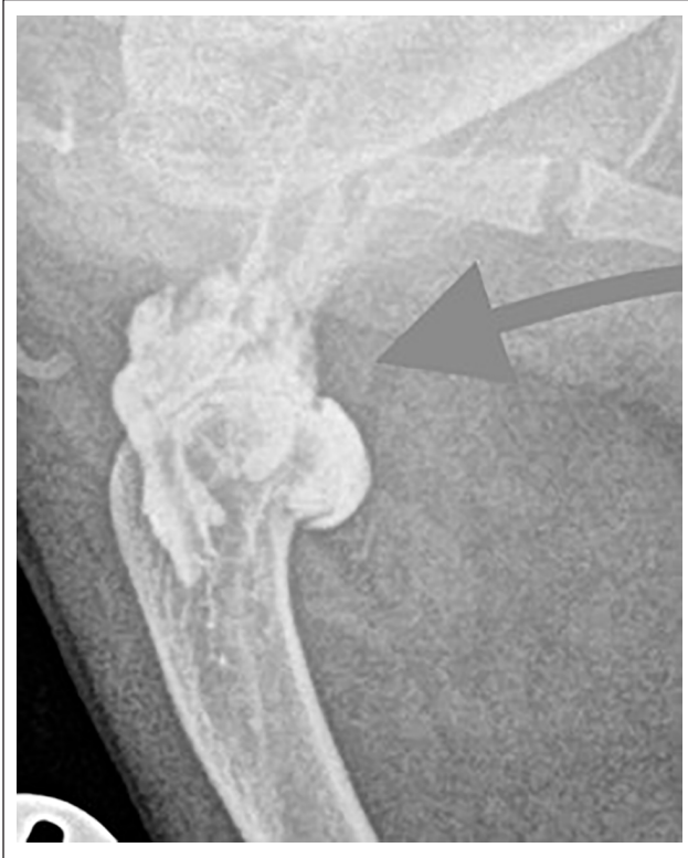
Figure 3 Arthrogram of the right glenohumeral joint; filling defect (arrow) opposite the ununited caudal glenoid

Skin closure was routine and 2.5 mg of bupivacaine (Marcaine 5 mg/ml; Astra Zeneca) was injected intra-articularly after closure.