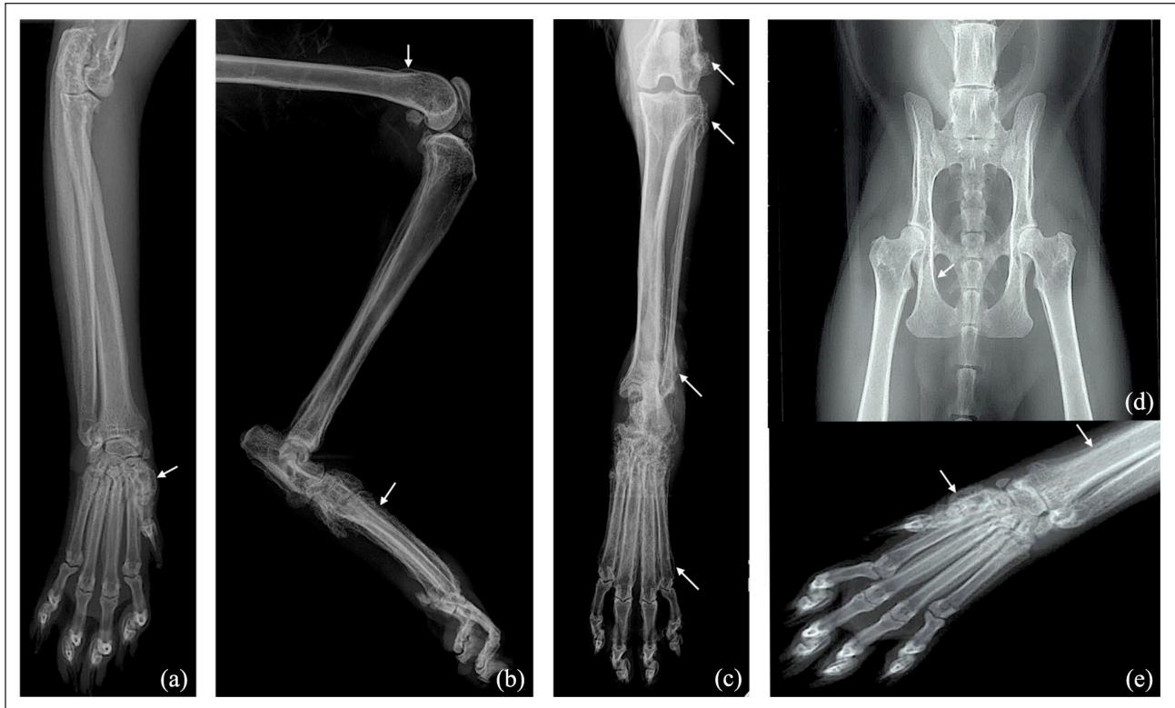
Figure 2 (a,b) Orthogonal radiographic views of the left hindlimb from the distal part of the femur to the extremity: note the thin and regular periosteal proliferation (arrows) on the diaphysis of the tibia and fibula, and palisade periosteal proliferation on the tarsal and metatarsal bones associated with severe thickening of the soft tissue. (c) Craniocaudal radiographic view of the right forelimb from the elbow to the extremity: note the thin and regular periosteal proliferation (arrows) on the diaphysis of the radius and ulna and palisade periosteal proliferation on the metacarpal bones. (d) Ventrodorsal radiographic view of the pelvis: note the smooth periosteal proliferation (arrow) on the lateral cortex of the right and left ilium and ischium, and on the medial cortex of the proximal right and left femurs. (e) Craniocaudal radiographic view of the right carpus and metacarpal and phalangeal bones: note the palisade periosteal proliferation (arrows) on the metacarpal bones

A full body CT examination was performed under general anaesthesia to increase the sensitivity of detection of primary and metastatic tumours 31 and to better define the renal lesion. The cat was premedicated with midazolam (Hypnovel; Roche) 0.2mg/kg IV and butorphanol (Torbugesic; Zoetis) 0.2mg/kg IV. General anaesthesia was induced with propofol (Rapinovet; Intervet) 5mg/kg IV to effect and maintained with isoflurane (Vetflurane; Virbac) administered with 100% oxygen. The CT examination confirmed subtotal invasion of the renal parenchyma by a tumour that displayed closed contact with the vena cava without invading it or the right adrenal gland (Figure 3). The CT scan also confirmed the presence of a ureterolith of 2.5mm in diameter located cranially to the left ureterovesical junction without signs of obstruction. There was no evidence of pulmonary metastasis, but a mild enlargement of the suprasternal lymph node was noted.