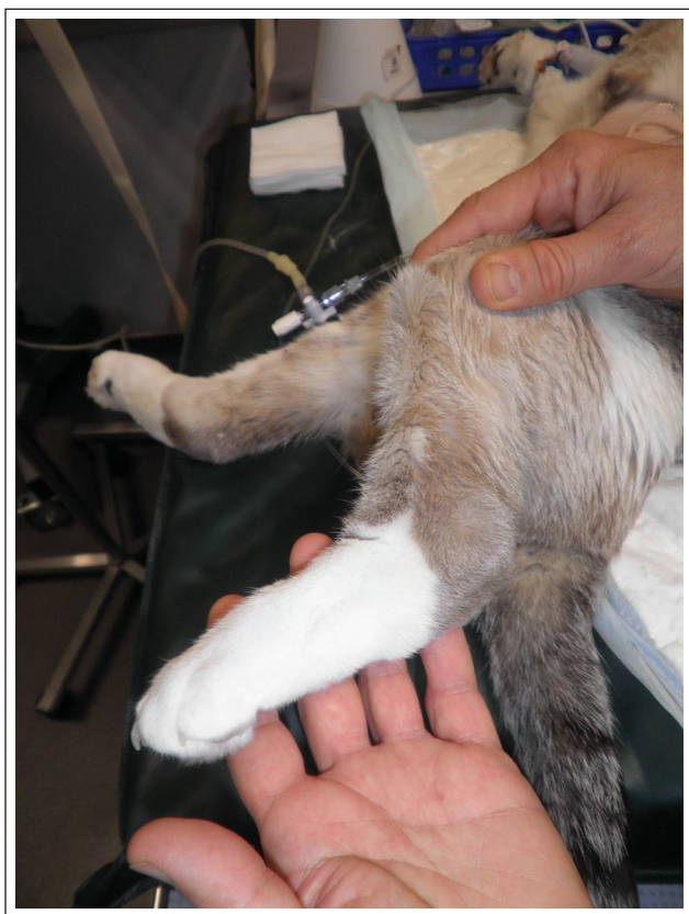
Figure 1 Thickening of the left hindlimb

A 10-year-old neutered male domestic shorthair cat (body weight 4.7 kg) was referred with several months' history of stiff and impaired gait and weight loss, which worsened in the month prior to admission. Nutraceuticals (ArthroSenior Chat; Laboratoires Clément Thékan) were previously prescribed by the referring veterinarian for suspected osteoarthritis of the hips. One capsule of the glucosamine–chondroitin supplement (glucosamine hydrochloride 50 mg, chondroitin sulfate 46 mg, ascorbic acid 15.6 mg) was administered q24h PO for 15 days without clinical improvement. The main abnormalities detected on physical and orthopaedic examination included hindlimb stiffness, reluctance to move and thickening of all four limbs (Figure 1). The range of motion of the stifles, hips, tarsi, carpi and elbows was also decreased, and manipulation of the long bones was painful. The cat also showed moderate bilateral