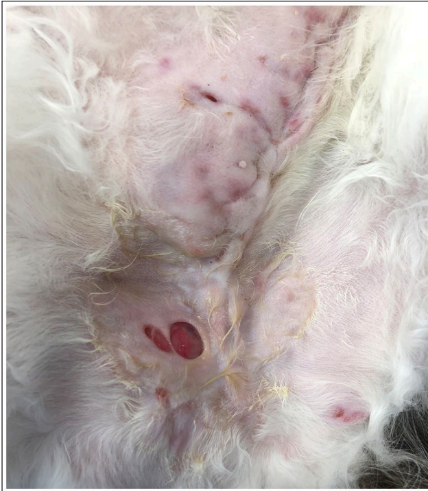
Figure 2 The cat first presented to the dermatology service with multiple erythematous-to-purpuric macules and ulcerations forming cavernous and communicating draining tracts on the ventral abdomen. A firm, irregularly shaped subcutaneous mass was present along the previous incision site and extended to the right

They extended into the musculature and contained very small amounts of serous exudate. An approximately 6×6 cm, palpable, firm, irregularly shaped subcutaneous mass was present along, and to the right of, the previous incision site. Physical examination was otherwise unremarkable.