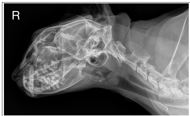
Figure 1 A round, homogeneously soft tissue opaque structure (ie, laryngeal cyst) was appreciated within the larynx on a right lateral radiograph of the head and neck region of the patient.

radiologist, with the pertinent finding of a homogeneously soft tissue opaque structure within the larynx, caudal to the epiglottis, which exhibited rounded cranial and caudal margins (Figure 1). The cat was referred for additional diagnostics and treatment.