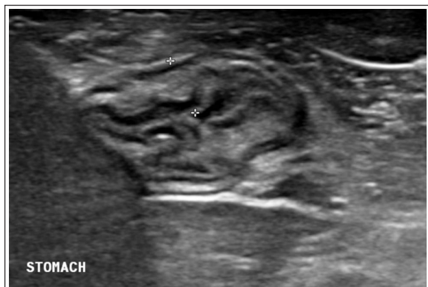
Figure 1 Diffuse concentric submucosal thickening of the gastric wall as shown on abdominal ultrasound