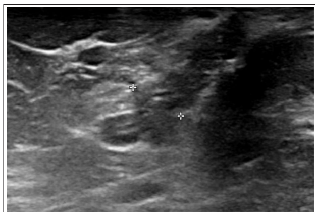
Figure 2 A hypoechoic pancreas with a mild increase in peripancreatic peritoneal echogenicity as shown on abdominal ultrasound

neutrophilia of 20.8 \times 10^9/l (RI 2–13). Differential diagnoses for anaemia included haemolysis or haemorrhage. Biochemistry showed moderately increased ALT (249 U/l; RI <60) and ALP activity (277 U/l; RI <50), mild hyperbilirubinemia (10.6 \mu\text{mol/l} ; RI 2.5–3.5) and mild hypercholesterolaemia (6 mmol/l; RI 1.9–3.9). Point-of-care feline leukaemia virus antigen and feline immunodeficiency virus antibody tests were negative. The activated partial thromboplastin time (APTT) was mildly prolonged at 132.0s (RI 65–119) and prothrombin time (PT) was within the RI at 19.0s (RI 15–22). Abdominal ultrasound identified diffuse concentric submucosal thickening of the gastric wall (wall thickness 0.3 cm; Figure 1) and a hypoechoic pancreas with a mild increase in peripancreatic peritoneal echogenicity (Figure 2). Ultrasonographic findings were suggestive of an intramural gastropathy and pancreatitis. Samples were sent for haemotropic mycoplasma PCR ( Mycoplasma haemofelis , Candidatus Mycoplasma haemominutum and