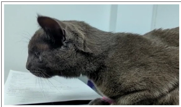
Figure 1 Extended-neck stance seen on presentation

It was suggested that a CT scan be performed, followed by potential endoscopy. However, owing to cost limitations, the decision was made to prioritise endoscopy over cross-sectional imaging. The cat was anaesthetised. A premedication of 0.3 mg/kg ketamine, 0.03 mg/kg medetomidine and 0.3 mg/kg methadone was given intravenously, and the cat was induced with propofol and maintained on oxygen and isoflurane. The larynx, tonsils, teeth, gingiva, tongue and hard palate were all examined and found to be of normal appearance. Otoscopic examination was unremarkable.