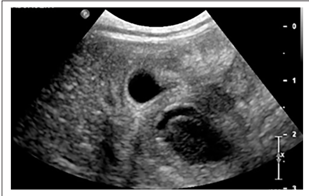
Figure 1 Abdominal ultrasound image. There is a large cavitated mass located dorsolateral to the gallbladder from an 8-year-old male neutered domestic shorthair cat