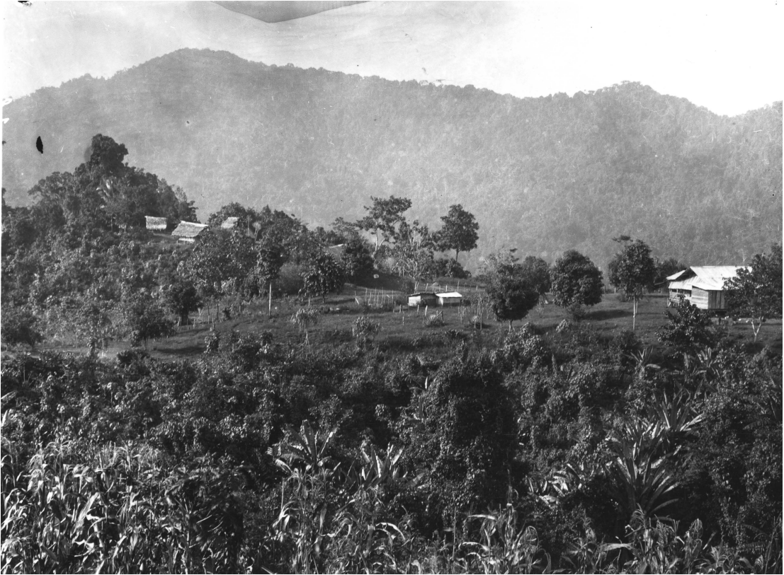
FIGURE 5. View of the mission at Keku.