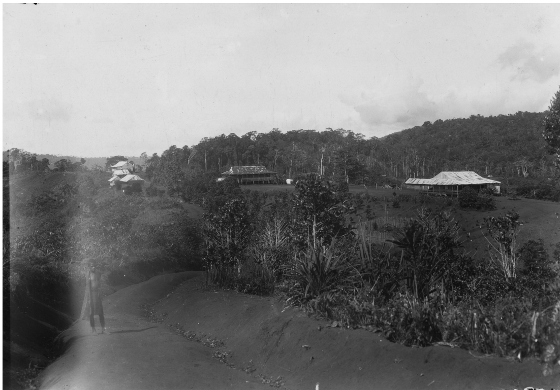
FIGURE 8. View of the surroundings at Wareo (AMNH negative no. 115801).

zigzagged up the sides of ridges to tracks across the narrow tops, with spectacular views of gardens on the steep hillsides. They arrived at Sevia, about 5000 ft, at 1 pm, just in time for the almost daily bank of fog to arrive (fig. 11). On one sunny afternoon, Beck followed a local trail to an elevation of 7500 ft. The summit of this ridge apparently marked the height of land in this part of the Cromwells, for the trail led downward to a village on the other side of the mountains. From these higher altitudes on sunny days the mountains of New Britain could be seen to the east.