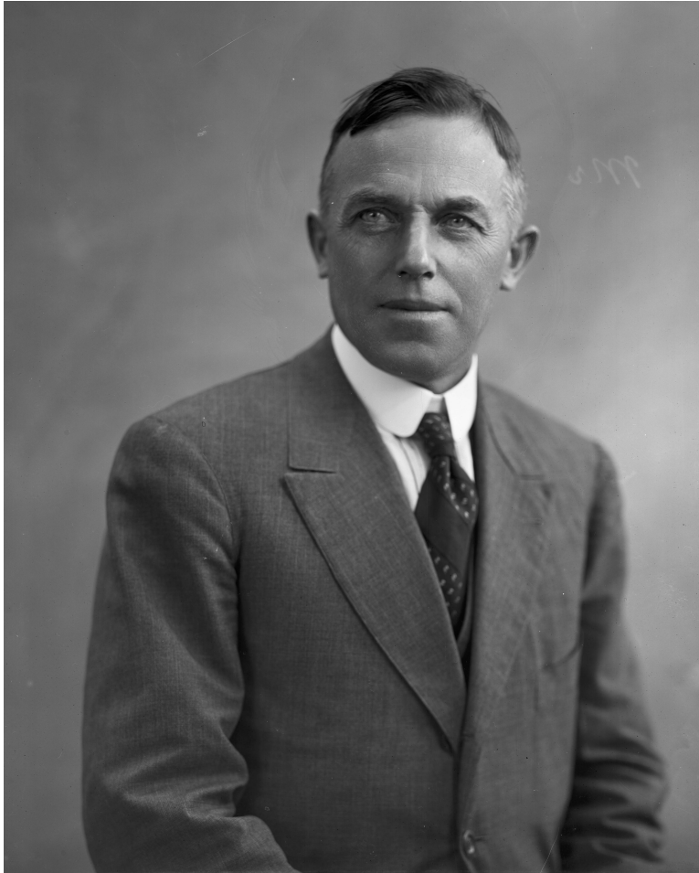
FIGURE 1. Rollo Howard Beck (1870–1950). Photograph made in 1917, at the end of the AMNH Brewster – Sanford Expedition (AMNH neg. no. 36747).

Guinea Birds (Mayr, 1941), Mayr was misled in some cases by these ambiguities in the localities of Beck's specimens.