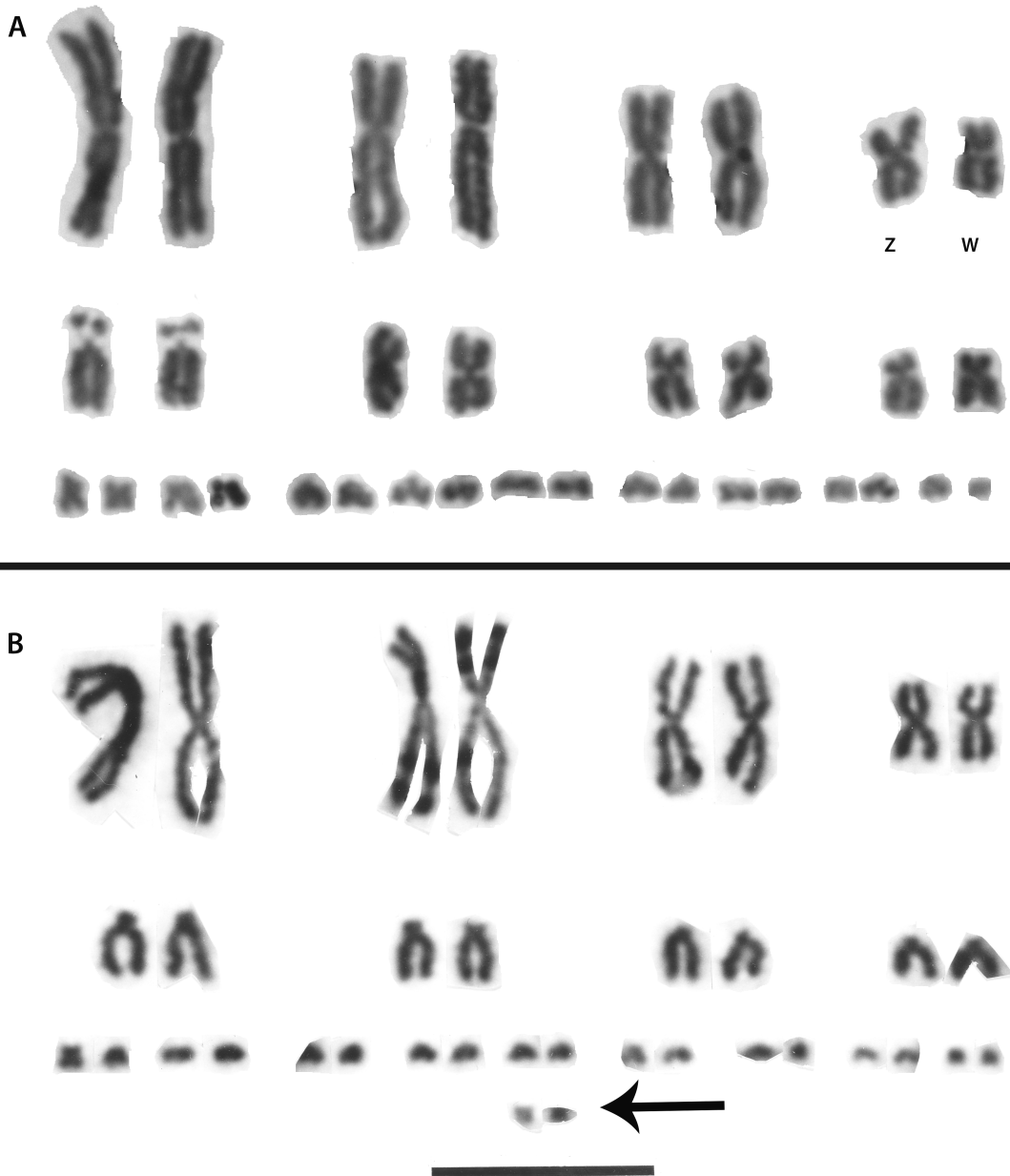
FIGURE 2. A. Karyotype of Oxybelis aeneus ( 2n = 34 , with 16 macrochromosomes and 18 microchromosomes), AMNH R-107584, female, with heteromorphic sex chromosomes, Z and W. B. Karyotype of Xenopeltis unicolor ( 2n = 36 , with 16 macrochromosomes and 20 microchromosomes), AMNH R-104370, male, representing an ancient karyotype of Serpentes (reproduced, reformatted, from Cole and Dowling, 1970). Scale bar = 10 \mu\text{m} .

ner, 1959; Bianchi et al., 1969; Baker et al., 1971, 1972; Gorman, 1973). As that suggestion decades ago was based on fewer species examined and some sketchy karyotype descriptions, we review that hypothesis here.