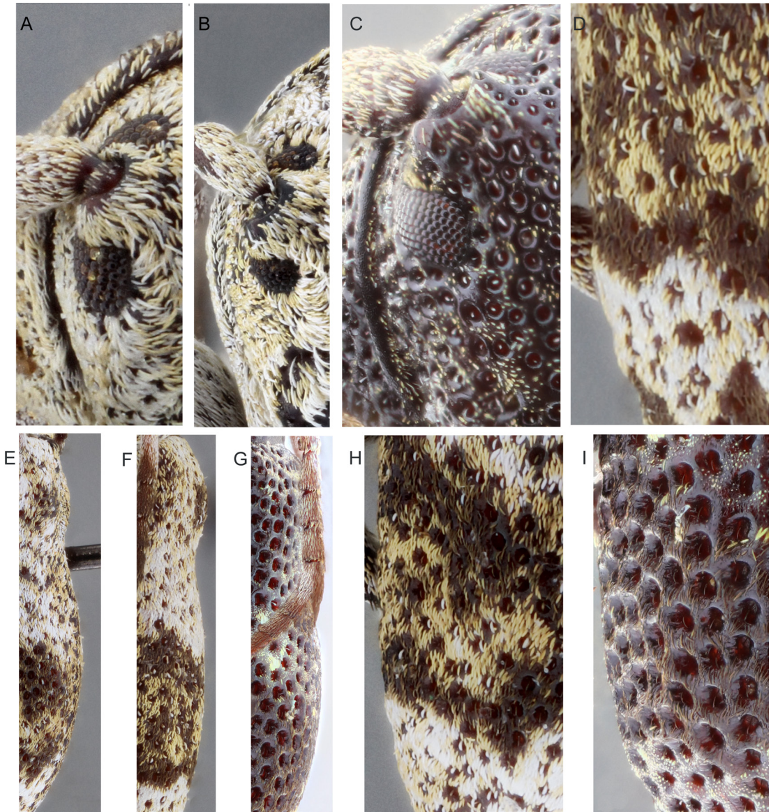
FIGURE 3. A–C. Eyes: A. Morrisia squamosa (Chemsak and Noguera, 1993), male; B. M. pulchra Santos-Silva et al., 2019, holotype female; C. M. skillmani , holotype male. D–F. Elytral curvature: D. M. squamosa , male; E. M. pulchra , holotype female; F. M. skillmani , holotype male. G–I. Elytral punctures on posterior half: G. M. squamosa , male; H. M. pulchra , holotype female; I. M. skillmani , holotype male.

decumbent, yellow and white setae not obscuring integument; apical third glabrous. Eyes almost divided; lower eye lobes with nine rows of ommatidia; distance between upper eye lobes 0.45\times distance between outer margins of eyes; in frontal view, distance between lower eye lobes 0.68\times distance between outer margins of eyes. Antennae missing antennomeres III–XI in left antenna; missing pedicel and antennomeres III–XI in right antenna; scape slightly widened basally, then subcylindrical toward apex, shorter than width between upper eye lobes, about