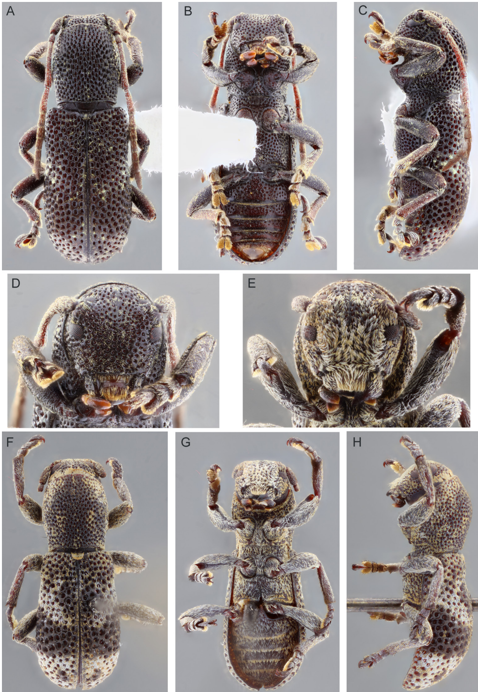
FIGURE 1. A–D. Morrisia skillmani , sp. nov., holotype male: A. Dorsal habitus; B. Ventral habitus; C. Lateral habitus; D. Head frontal view. E–H. Adetaptera jejetama , sp. nov., holotype male: E. Head frontal view; F. Dorsal habitus; G. Ventral habitus; H. Lateral habitus.