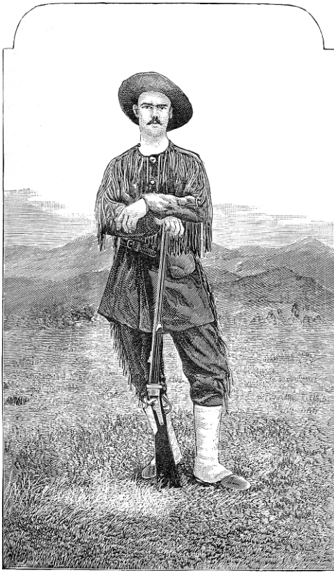
Fig. 2. Joseph H. Batty in costume, from his book on Practical Taxidermy (Batty, 1880).

Batty collected in the lowlands of western Panama before most of the forests were removed from that area, so his specimens from there, even if mislabeled, may retain considerable scientific and historical importance.