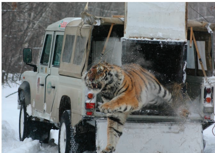
A wild Amur tiger bursts from a cage after being rescued from a poacher’s snare by personnel from the Wildlife Conservation Society and Russia’s Inspection Tiger. The tiger was found by field workers conducting a survey of tiger prey species. Aside from minor abrasions from the snare cable, the tiger was unharmed.

another source for translocation. Is the seemingly impossible—returning tigers to Central Asia—in fact possible?