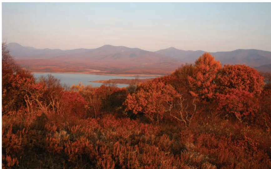
This autumn landscape shows the Sikhote-Alin Biosphere Zapovednik (reserve) on the coast of the Sea of Japan. The brackish lake, called Blogadotna, which loosely translates as “thankful place,” harbored a small fishing village in the 1950s but is now fully protected under Russia’s zapovednik system. The area is prime habitat for red and sika deer and, thus, for tigers.

Despite the drop in Russia’s wild tiger numbers, proponents of an Amur tiger reintroduction in Central Asia believe the effort is an important step. It would allow for restoration of the tigers’ natural range, they say, and hedge against the risk of extinction facing all small populations from factors such as disease. The tigers also may come from captive-bred Amur tigers. With behavioral training to hunt in the wild, some biologists believe, Amur tigers in zoos around the world offer