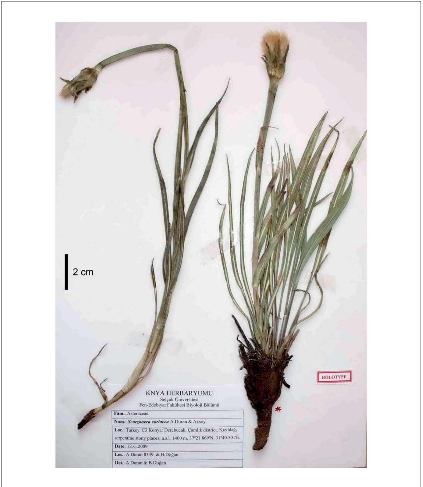
Fig. 1. – Holotype of Scorzonera coriacea A. Duran & Aksoy.