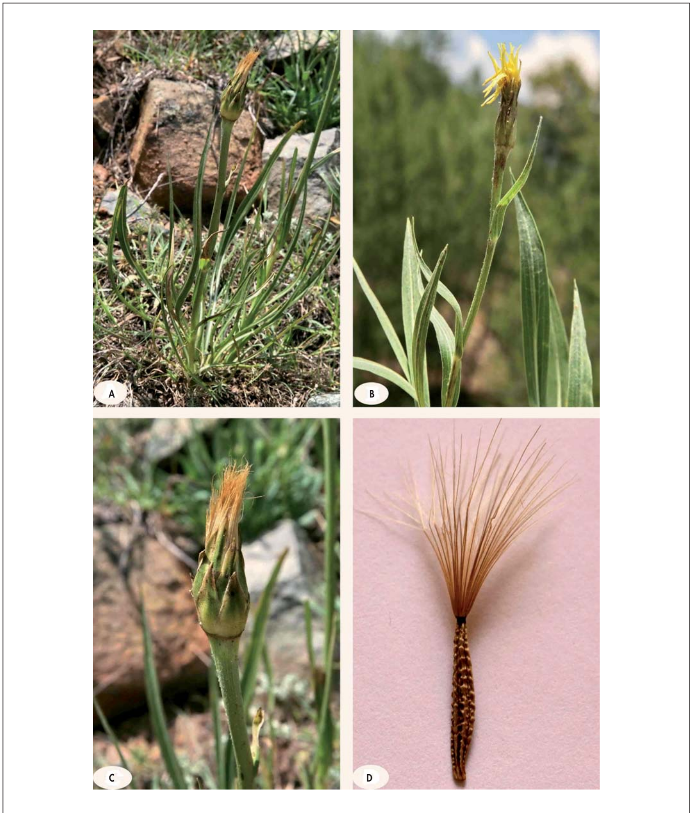
Fig. 2. – Scorzonera coriacea A. Duran & Aksoy. A. Habit; B. Capitulum at anthesis; C. Capitulum in fruit; D. Achene.