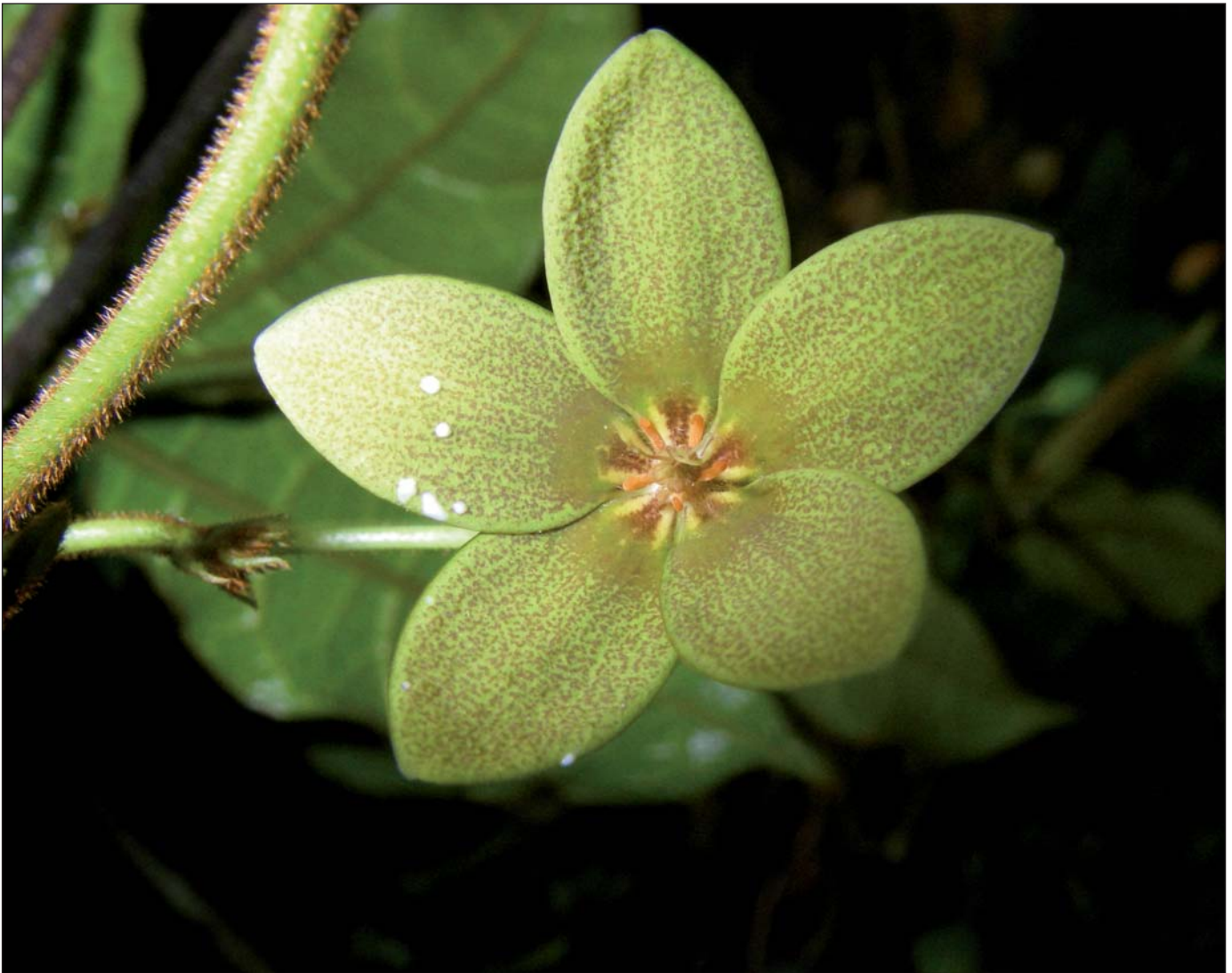
Fig. 2. – Flower of Calyptranthera viridiflava Ammann, L. Gaut. & Klack.