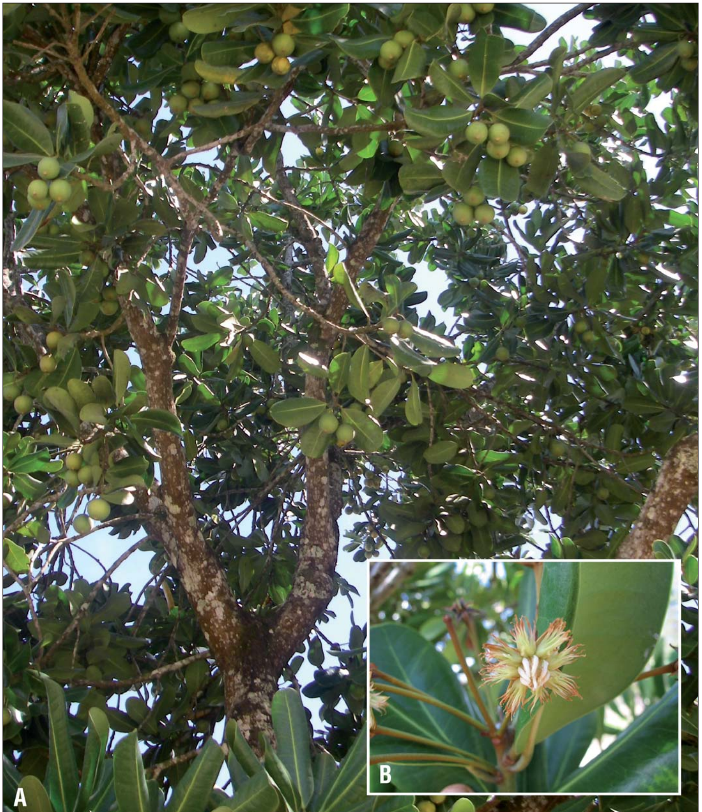
Fig. 1. – Mimusops coriacea (A. DC.) Miq. A. In fruit near Masoala, Eastern Madagascar; B. Flower in Orangea, Antsiranana.