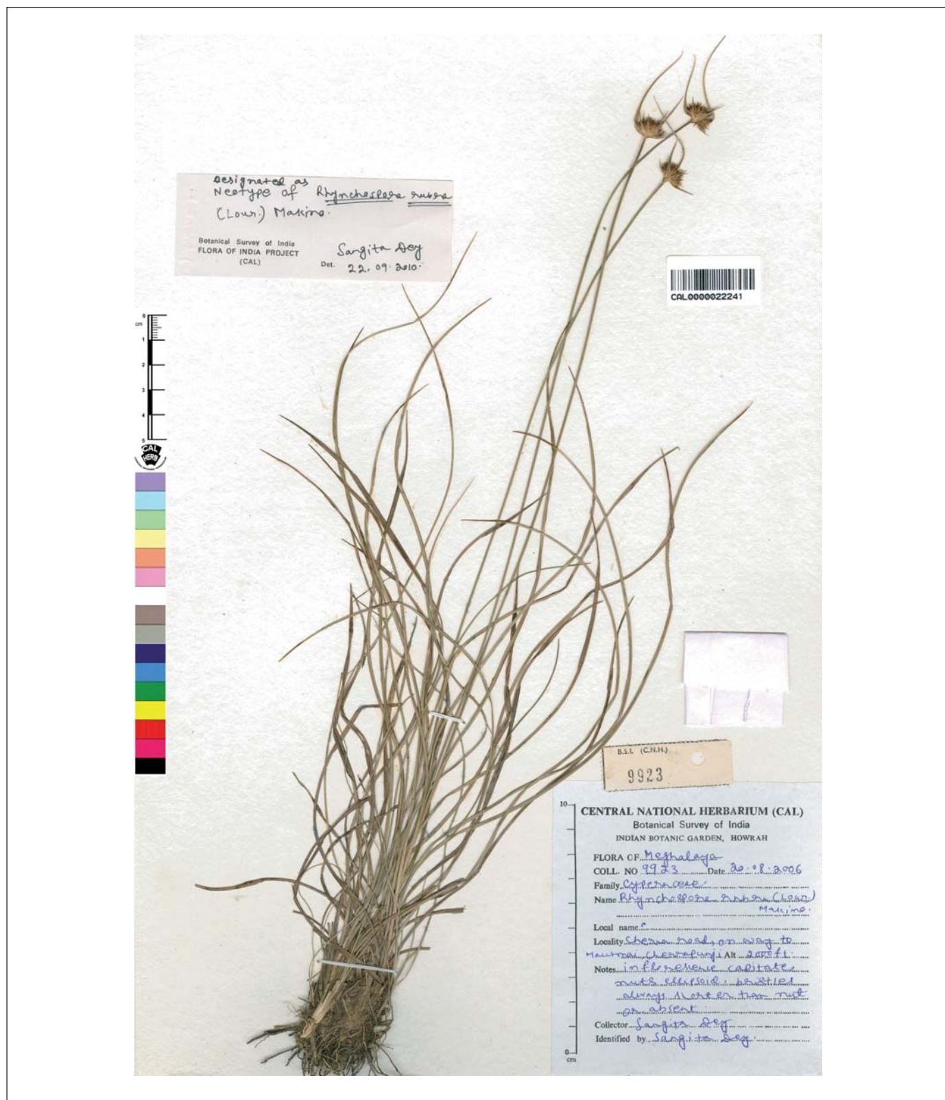
Fig. 3. – Neotypus of Rhynchospora rubra (Lour.) Makino.

[Sangita Dey 9923, CAL]