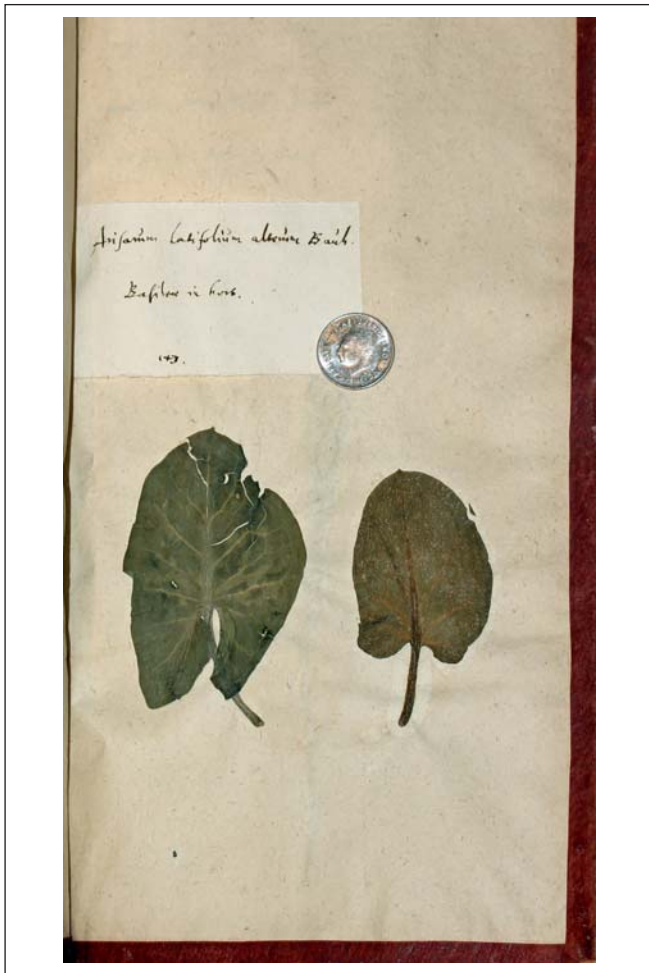
Fig. 2. – Original material of Arum arisarum L. [s.coll., UPS-BURSER]

Therefore, as the herbarium sheet in UPS-BURSER (Herb. Burser X: 143) is very incomplete, we select here as the lectotype the element of the protologue which best matches the traditional and current concept of Arum arisarum . Among the elements cited in the protologue, the illustrations by CLUSIUS (1601) and LOBELIUS (1581) clearly shows the characters of the leaves, spathe and spadix as indicated by LINNAEUS (1753), “ acaule, foliis cordato-oblongis, spatha bifida, spadice incurvo ”, and they are therefore suitable for typification of A. arisarum . These two illustrations are identical, therefore we designated here the Clusius’s illustration as the lectotype (Fig. 1).