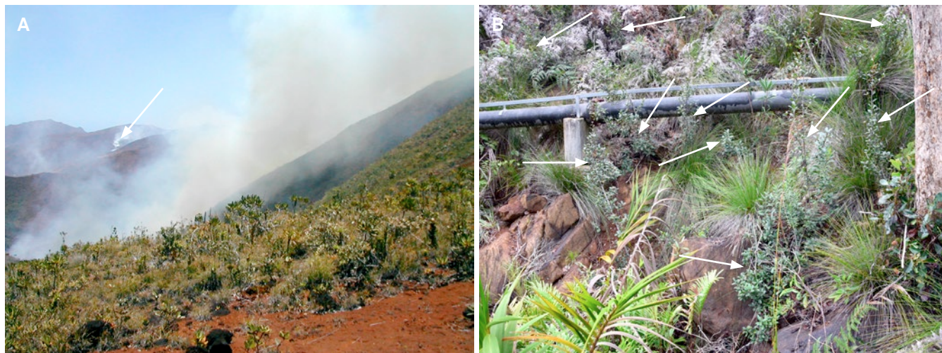
Fig. 1. – Pichonia munzingeri Gâteblé & Swenson. A. Overview of the Montagne des Sources fire on 29 December 2005, the arrow points to the fire in the Oumbéa creek; B. Upper population in degraded maquis vegetation showing Pteridium esculentum (G. Forst.) Cockayne flammable dead whitish fronds along the pipe to the water catchment, arrows point to ten individuals of Pichonia munzingeri .

Holotypus: NEW CALEDONIA. Prov. Sud: Mont-Dore, La Coulée, Captage de la Oumbéa, 21°11'19"S 166°34'22"E, 150 m, 14.III.2018, fl., Gâteblé & Rochard 1011 (P [P001156237]!; iso-: G [G00341841]!, MO!, MPU!, NOU [NOU089084]!, S [S18-39759]!).