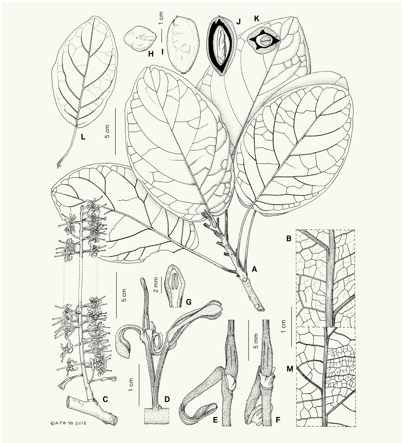
Fig. 1. – Kermadecia brinoniae H.C. Hopkins & Pillon (A–K) and K. elliptica Brongn. & Gris (L–M).

A. Vegetative shoot; B. Detail of leaf, abaxial surface, all veins raised except the finest branches, these shown as dotted lines; C. Inflorescence (total length 21.5 cm), showing flowers in pairs; D. Pair of flowers from C, each flower on a free pedicel (apex of axis to the left); E–F. Lateral and ventral view of opened flower with only one tepal remaining, to show the disc; G. Inner face of distal portion of tepal, showing a stamen; H–I. Apical and lateral views of mature fruit; J–K. L.S. and T.S. of mature fruit (black shading = very dense endocarp); L. Leaf, adaxial surface; M. Detail of L, abaxial surface, midrib and secondary veins raised, note numerous small areoles. [A–G: McPherson 1945, P; H–K: MacKee 16339, P; L–M: Vieillard 1106, K] [Drawing: Andrew Brown]