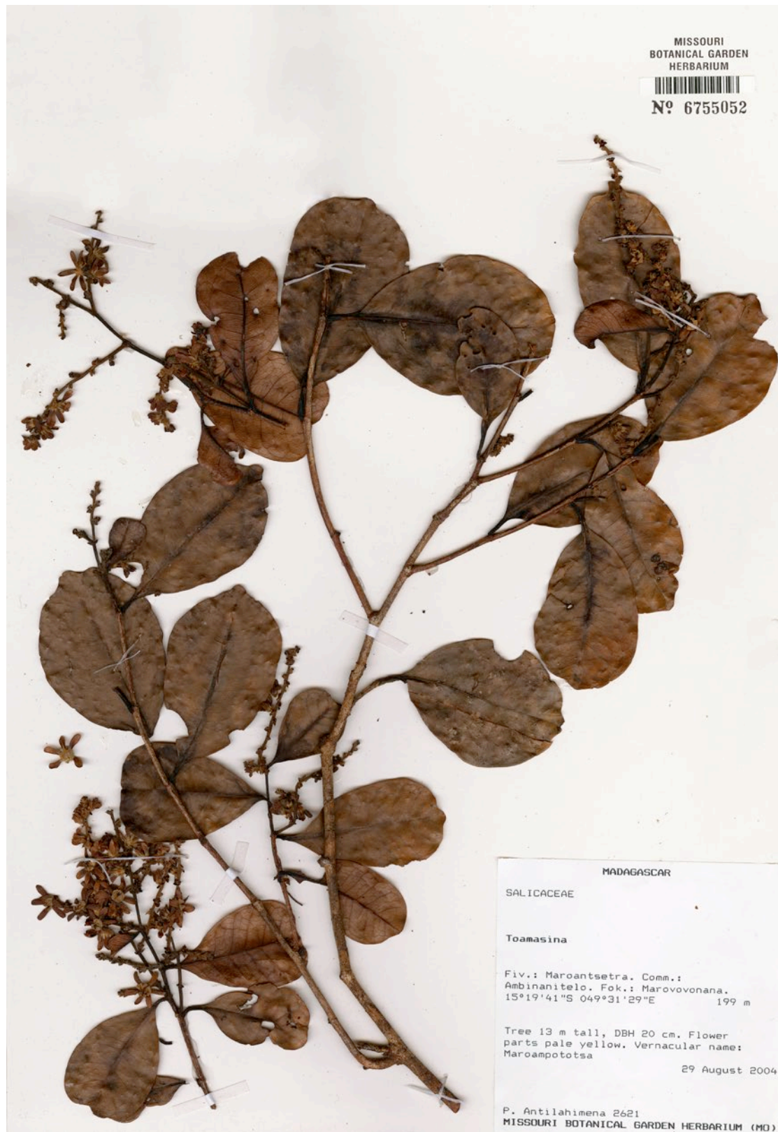
Fig. 2. – Holotype of Homalium antilahimena Wassel & Appleg. [ Antilahimena 2621, MO]