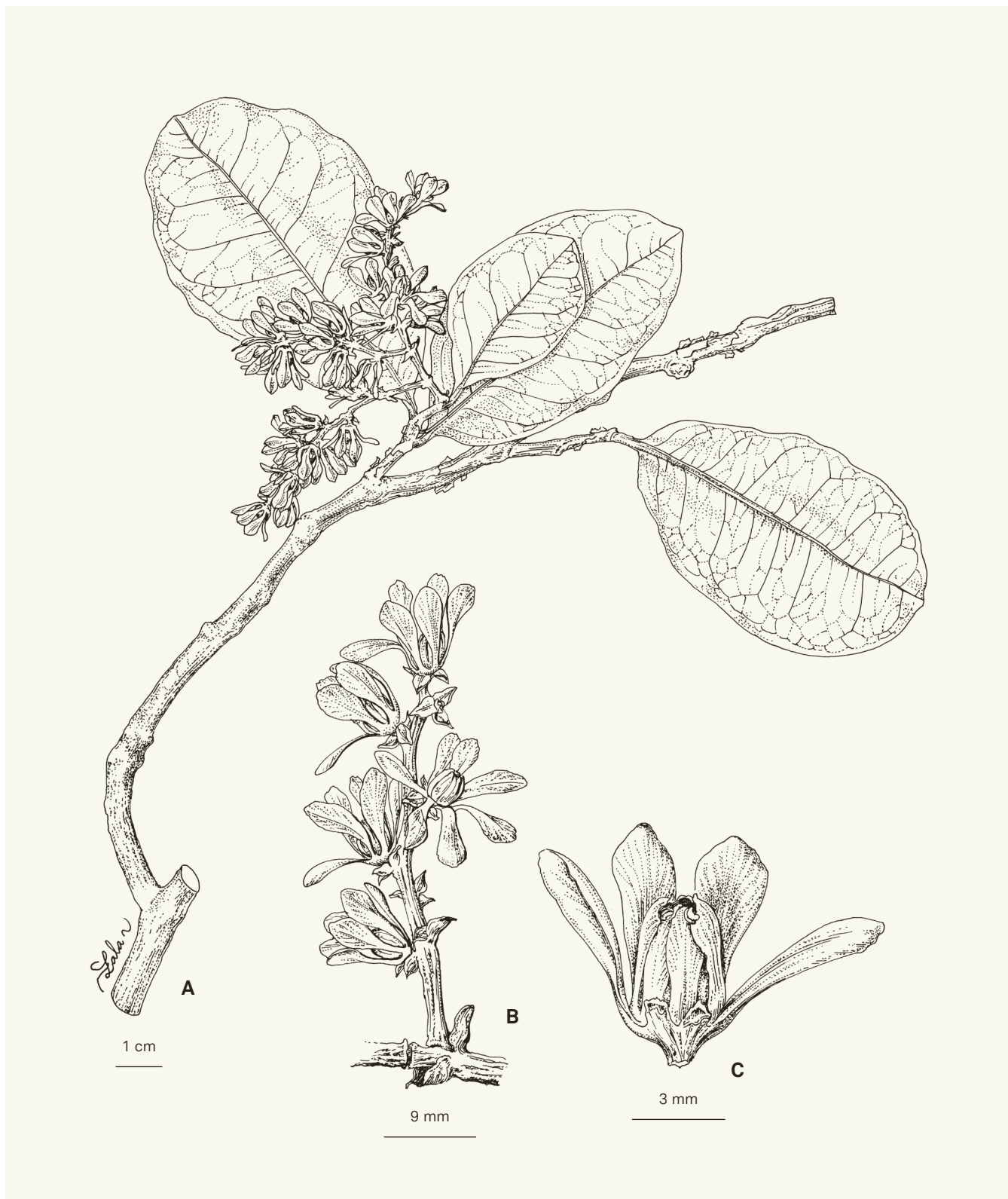
Fig. 5. – Homalium pachycladum Wassel & Appleq. A. Flowering branch; B. Inflorescence; C. Flower post-anthesis. [Antilahimena et al. 1540, TAN] [Drawings: R.L. Andriamiarisoa]