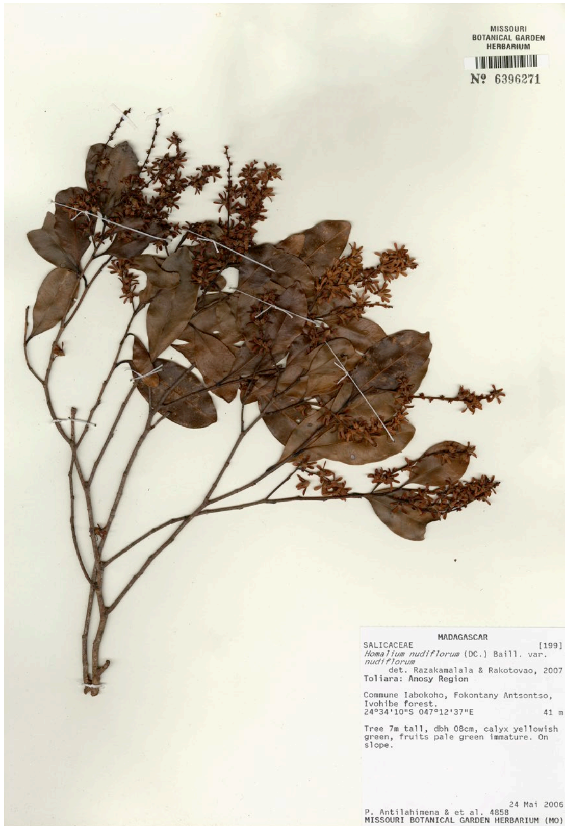
Fig. 7. – Holotype of Homalium tenue Wassel & Appleq. [Antilahimena 4858, MO]