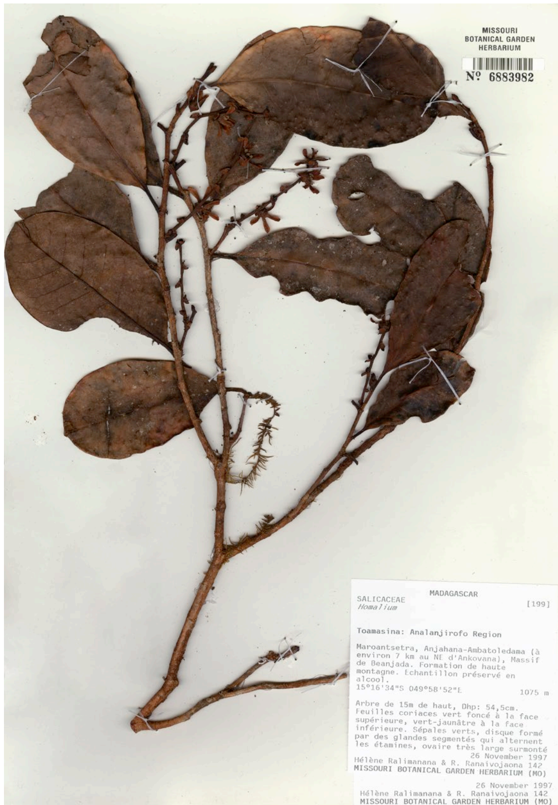
Fig. 6. – Holotype of Homalium stelliferum subsp. andapense Wassel & Appleg. [Ralimanana & Ranaivojaona 142, MO]