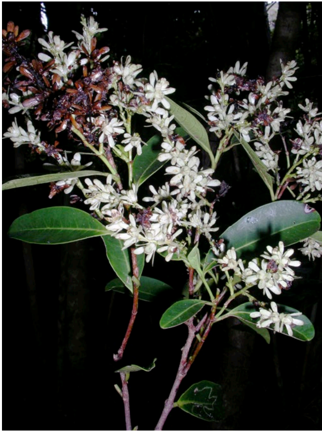
Fig. 4. – Inflorescences of Homalium nudiflorum (DC.) Baill. [Nusbaumer 1261]