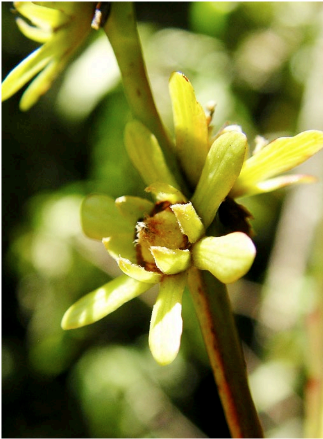
Fig. 1. – Flower of Homalium confertum Baker post-anthesis. [Buerki 106]

has traditionally been divided into six provinces, but these have recently been dissolved and the country divided into 22 regions. Because provincial names will still be more familiar to many readers, localities are organized by region, with the province of which each region was formerly a part given in brackets. A complete index of specimens seen is provided as an appendix. Maps of georeferenced specimens that have been databased in Tropicos may be viewed within the Missouri Botanical Garden's Catalogue of the Plants of Madagascar project (MADAGASCAR CATALOGUE, 2020), which is continually updated with new determinations and specimens.