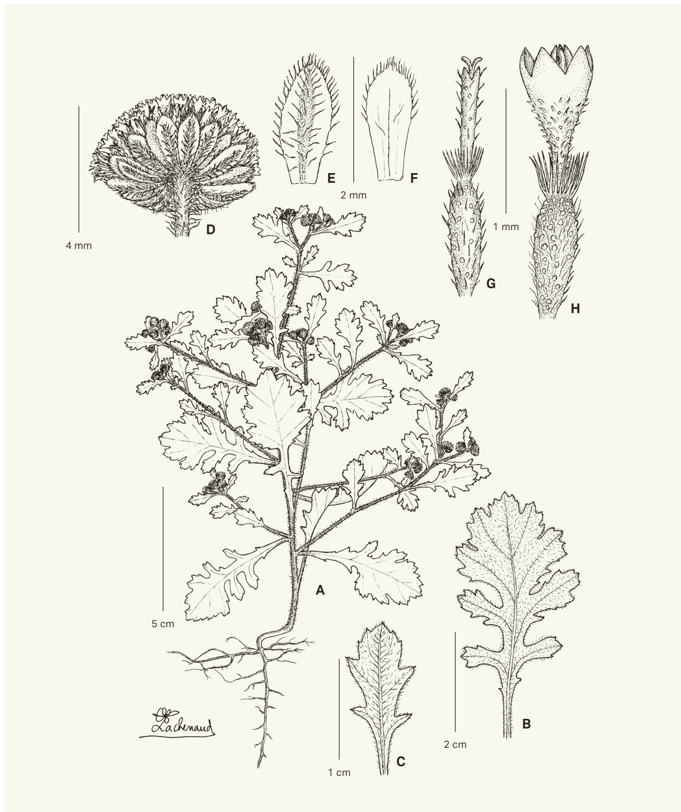
Fig. 2. – Grangea ogoouensis O. Lachenaud & Beentje. A. Plant in flower; B. Basal leaf; C. Upper leaf; D. Capitula; E. Outer phyllary; F. Inner phyllary; G. Outer (female) floret; H. Inner (hermaphrodite) floret. [Bidault et al. 1822, BR] [Drawing: O. Lachenaud]