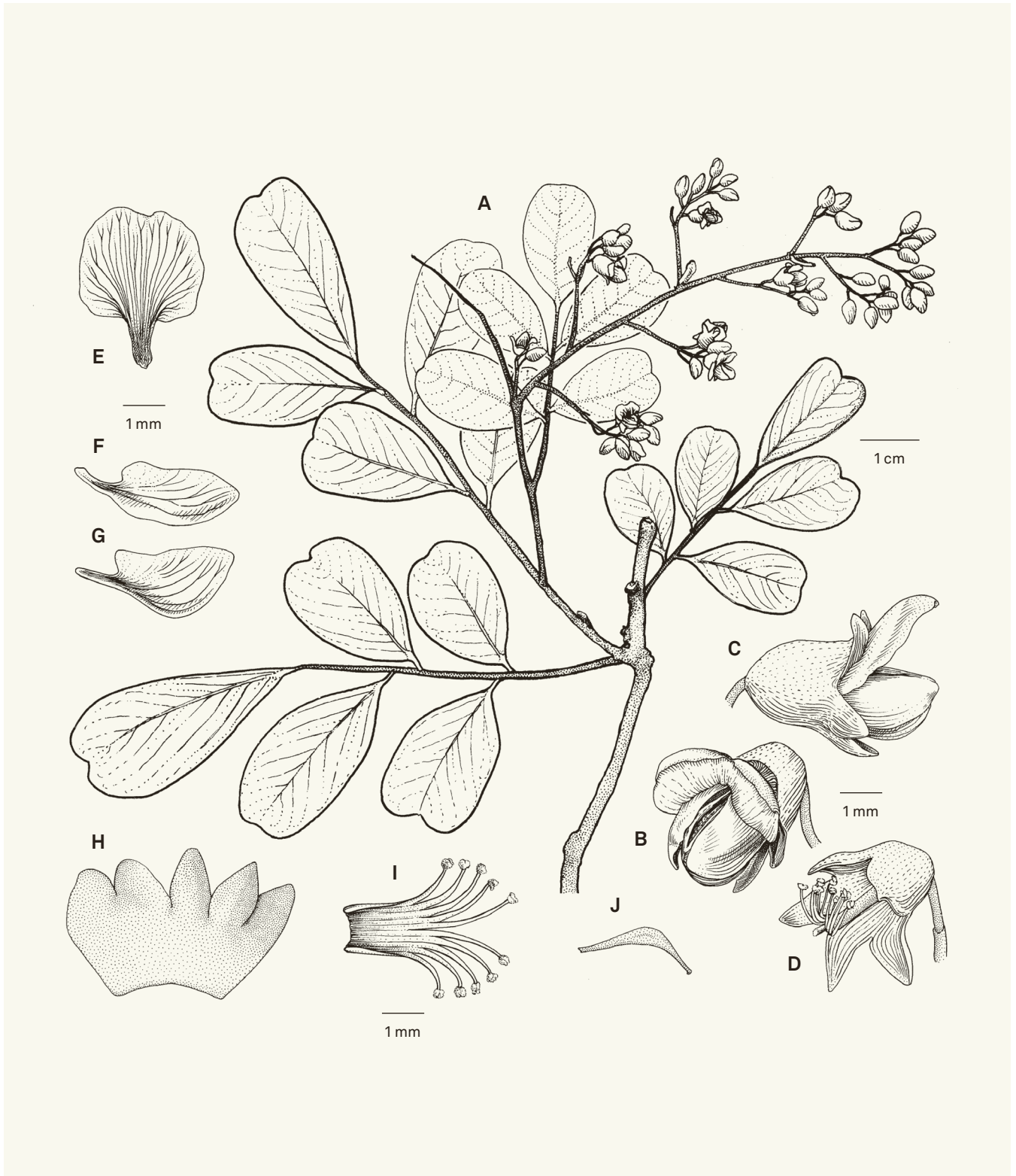
Fig. 5. – Dalbergia obcordata N. Wilding, Phillipson & Cramer. A. Flowering branch; B–C. Flower; D. Flower (with petals removed); E. Standard petal (adaxial surface); F. Wing petal (adaxial surface); G. Keel petal (adaxial surface); H. Calyx (outer surface; split open and flattened); I. Androecium (split open to show adaxial surface); J. Gynoecium. [Gautier et al. 4567, P] [Drawings: M. Lanas]