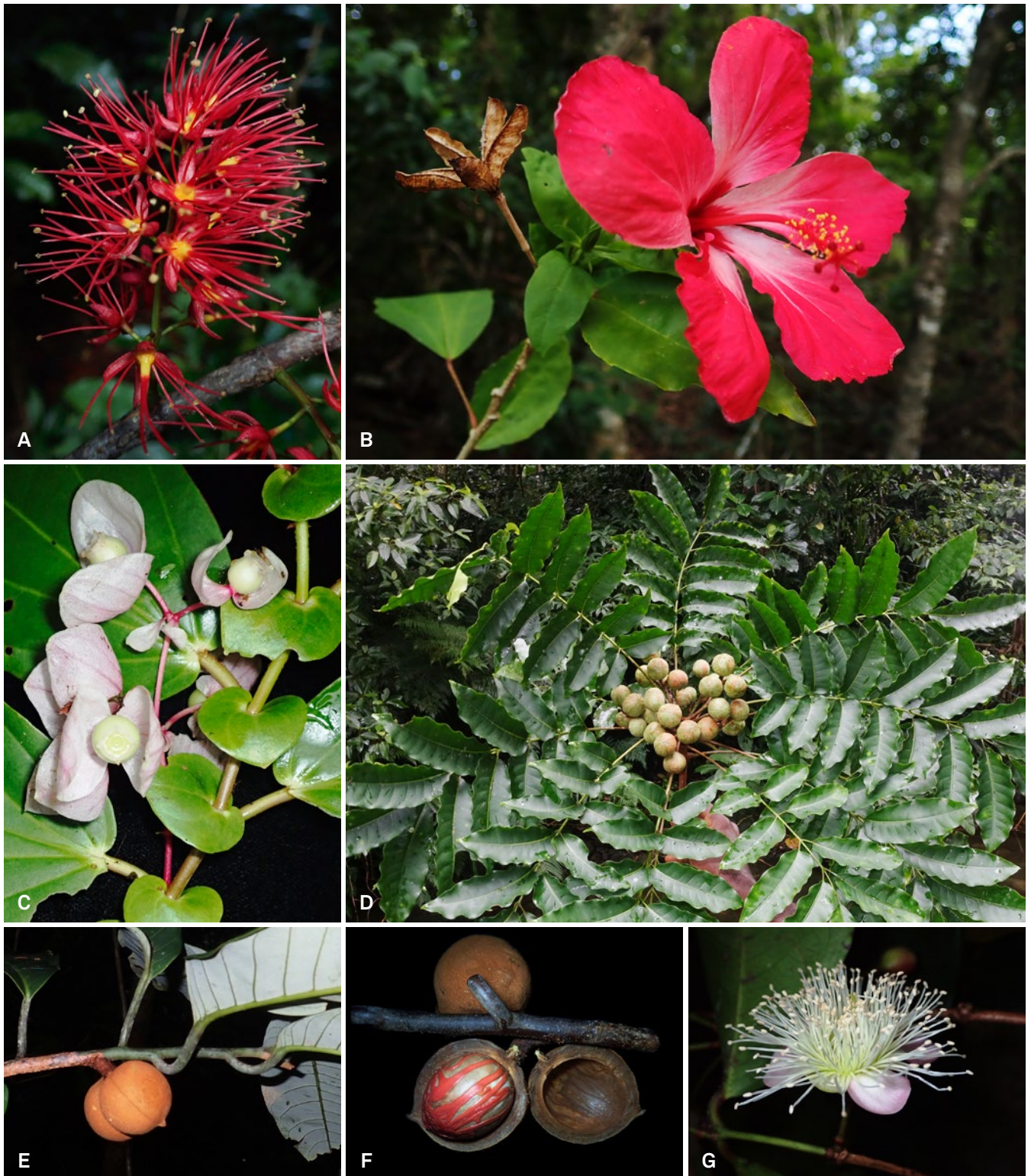
Fig. 4. – A. Geissois denhamii Seem. (Cunoniaceae); B. Hibiscus cooperi Meehan (Malvaceae); C. Medinilla heteromorphophylla Guillaumin (Melastomataceae); D. Didymocheton aneityensis (Guillaumin) Harms (Meliaceae); E, F. Myristica guillauminiana A.C. Sm. (Myristicaceae); G. Syzygium aneityense Guillaumin (Myrtaceae).