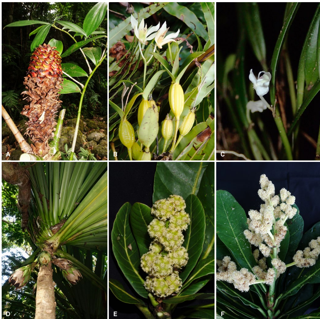
Fig. 3. – A. Tapeinochilos sp. nov. (Costaceae); B. Dendrobium mooreanum Lindl. (Orchidaceae); C. Dendrobium vanuatuense Schuit. & P.B. Adams (Orchidaceae); D. Pandanus halleorum B.C. Stone (Pandanaceae); E, F. Meryta neobudica (Guillaumin) Harms (female and male) (Araliaceae). [A: Plunkett 4670; B: Plunkett 4666; C: Plunkett 5634; D: Plunkett 5053; E: Plunkett 4163; F: Plunkett 4164]