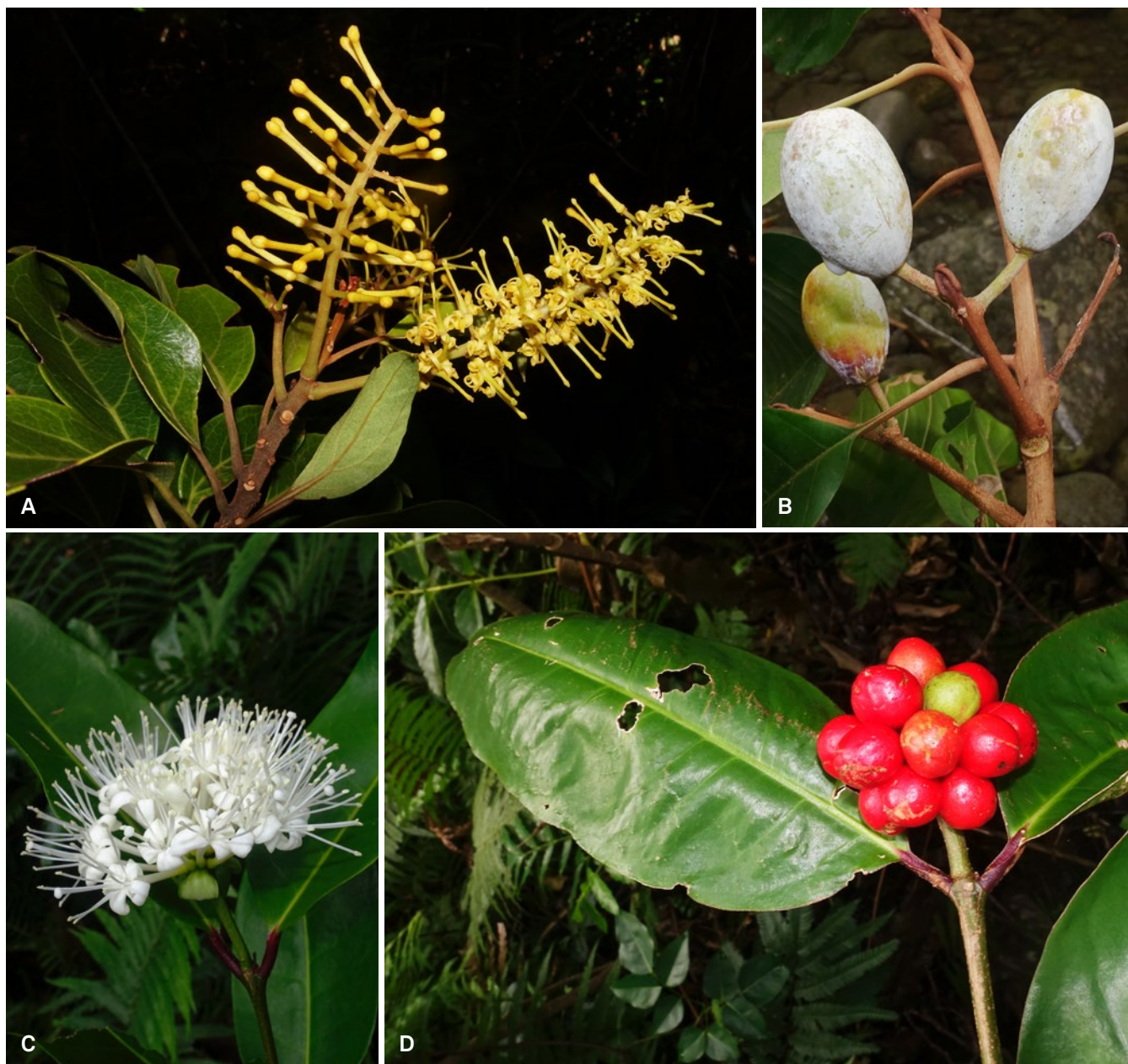
Fig. 5. – A. Turrillia lutea (Guillaumin) A.C. Sm. (Proteaceae); B. Palaquium neoebudicum Guillaumin (Sapotaceae); C, D. Phaleria pentecostalis Leandri (Thymelaeaceae). [A: Plunkett 4194; B: Plunkett 4546; C, D: Plunkett 5433]