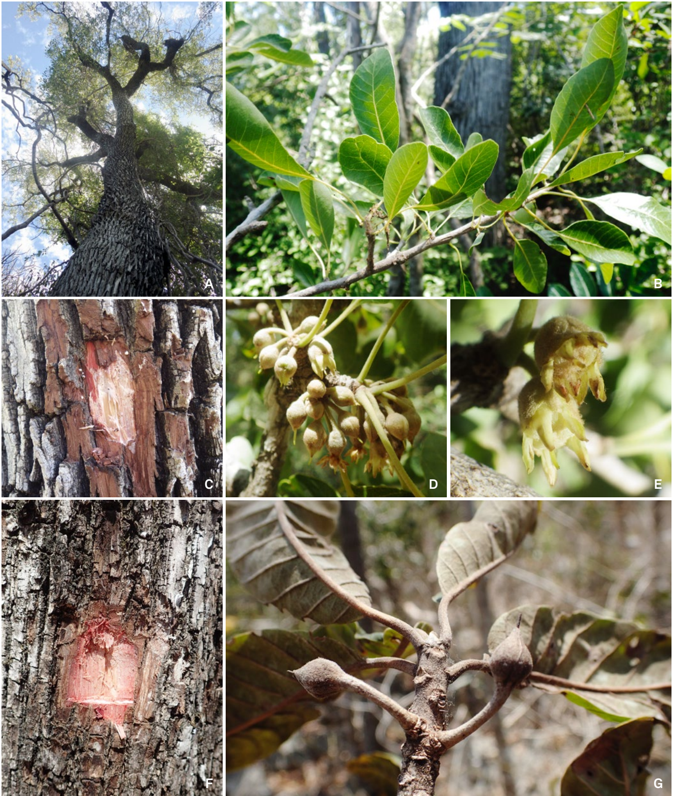
Fig. 2. – Capurodendron miquearum L. Gaut. & Boluda: A. Habit; B. Twig; C. Slashed bark; D. Fascicles of flowers; E. Flowers. Capurodendron namorokense L. Gaut. & Boluda: F. Slashed bark; G. Twig with two old flowers in an early fruit development stage. [A: Gautier 6329; B–E: Gautier 6339; F–G: Gautier et al. 6276]