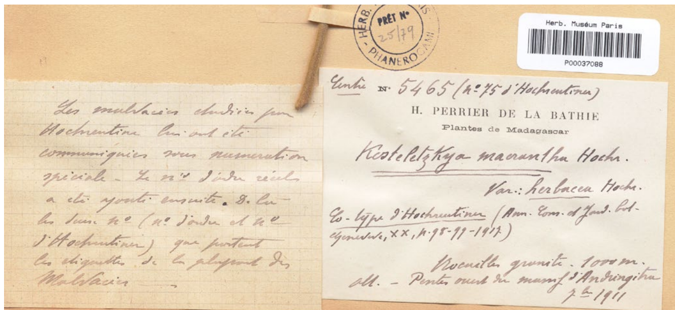
Fig. 1. – Label of the isotype of Kosteletzkya macrantha var. herbacea Hochr. at P with Perrier de la Bâthie's handwriting. [Perrier de la Bâthie 5465, P] [P00037088]

Vernacular name. – “Mainaty” ( Service Forestier 9422).