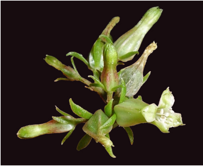
Fig. 1. – Close-up of flowers of Kalanchoe apiifolia D.-P. Klein, Shtein & Callm. [Rakotovao et al. 2327]