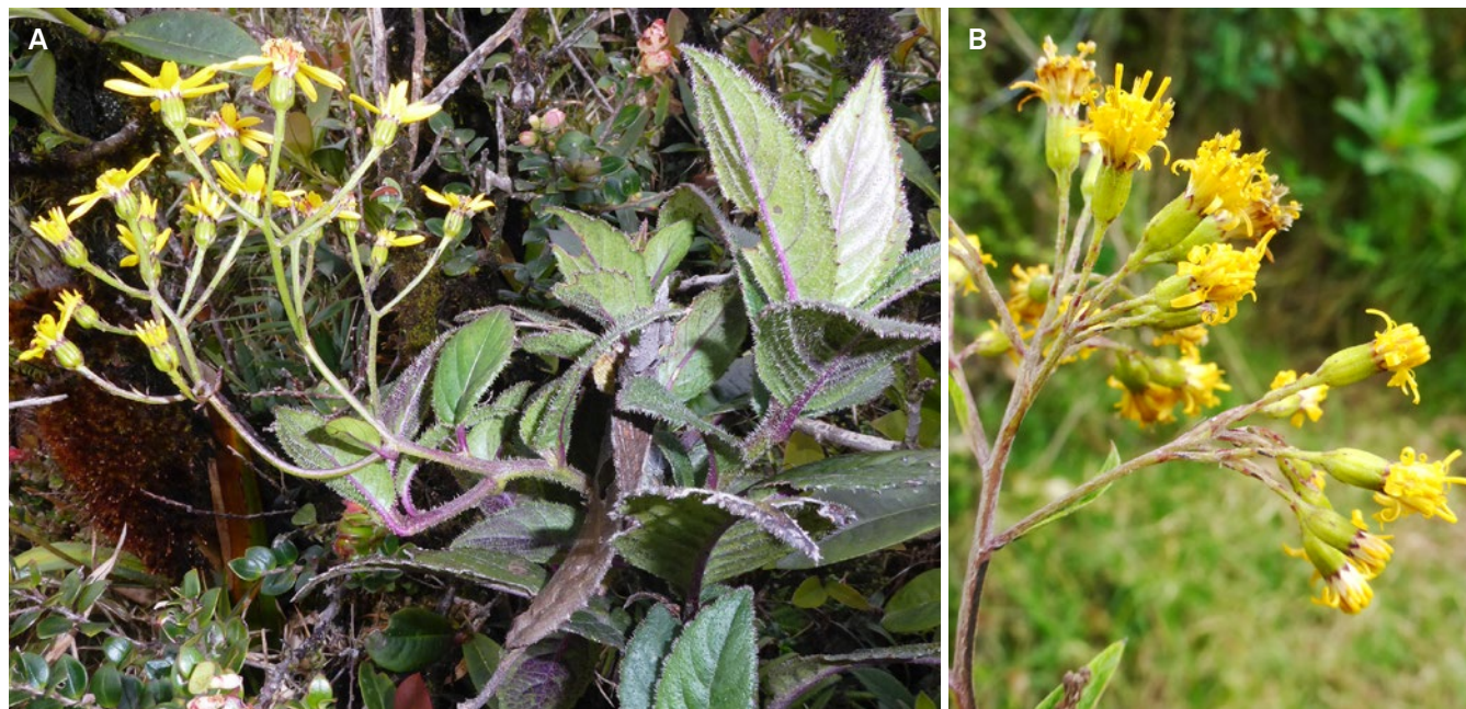
Fig. 4. – A. Dendrophorbium dodsonii (H. Rob. & Cuatrec.) B. Nord. B. Dendrophorbium sotarense (Hieron.) C. Jeffrey.