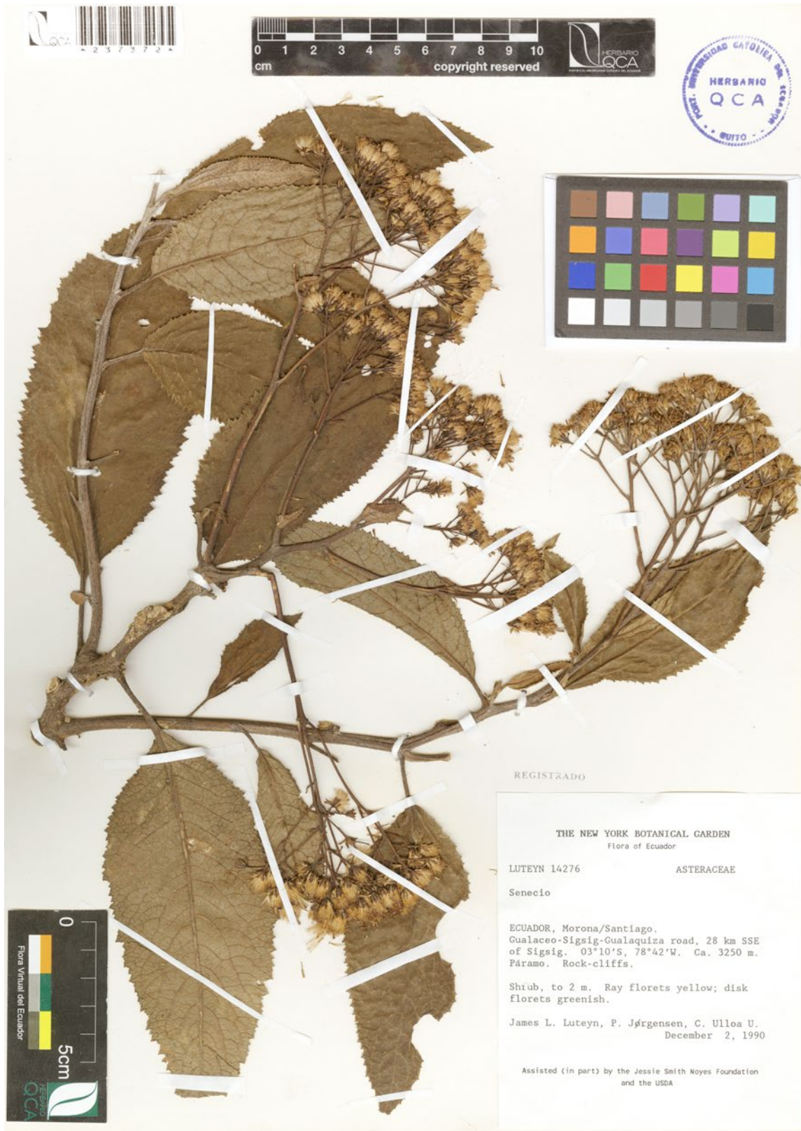
Fig. 1. – Holotype of Dendrophorbium frezierifolium J. Calvo & Á.J. Pérez at QCA. [Luteyn et al. 14276, QCA23732]