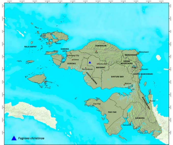
Fig. 4. – Distribution of Fagraea christinae Y.W. Low & V.A. Albert in the Bird's Head Peninsula, New Guinea. Solid coloured area of the map reflects the West Papua Province (before the 2022 split into two separate provinces, Southwest Papua and West Papua), Indonesia.

Conservation Status. – Fagraea christinae is rare and known from four locations in primary rainforest to secondary forest around the Ayamaru Lakes, where its habitat is threatened by the rapid growth of settlements around the lakes (SOLOSSA et al., 2013). The extent of occurrence (EOO) of the species is estimated to be c. 156 km 2 (which falls within the 100 km 2 upper limit for CR status under the subcriterion B1), whereas its area of occupancy (AOO) is estimated to be 16 km 2 (which falls within the 500 km 2 lower limit for EN status under the subcriterion B2). Based on satellite data on forest cover obtained for Indonesian New Guinea between 2001 to 2019, GAVEAU et al. (2021) estimated that 83% (34.29 million hectares) of the region remains forested, with a predicted deforestation rate on an upward trend. Over 19 years, 2% (0.75 million hectares) of forest was cleared (GAVEAU et al., 2021).