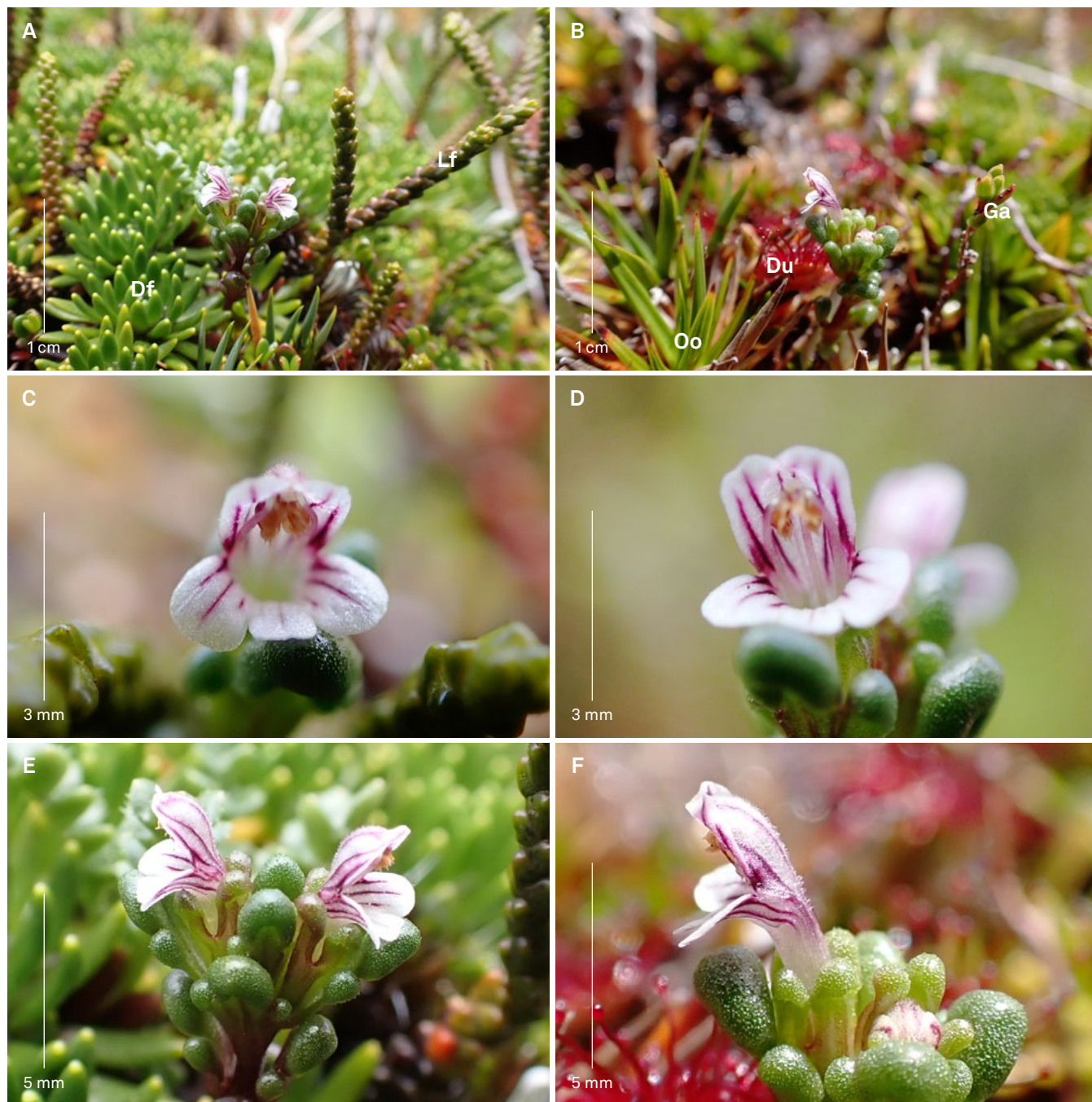
Fig. 2. – Euphrasia perpusilla Phil. A, B. Plants among associate flora and vegetation (Df: Donatia fascicularis , Lf: Lepidothamnus fonkii , Oo: Oreobolus obtusangulus , Du: Drosera uniflora , Ga: Gaultheria antarctica ); C, D. Frontal view of the flowers; E, F. Lateral view of the flowers. [Saldivia & Faúndez 4211]