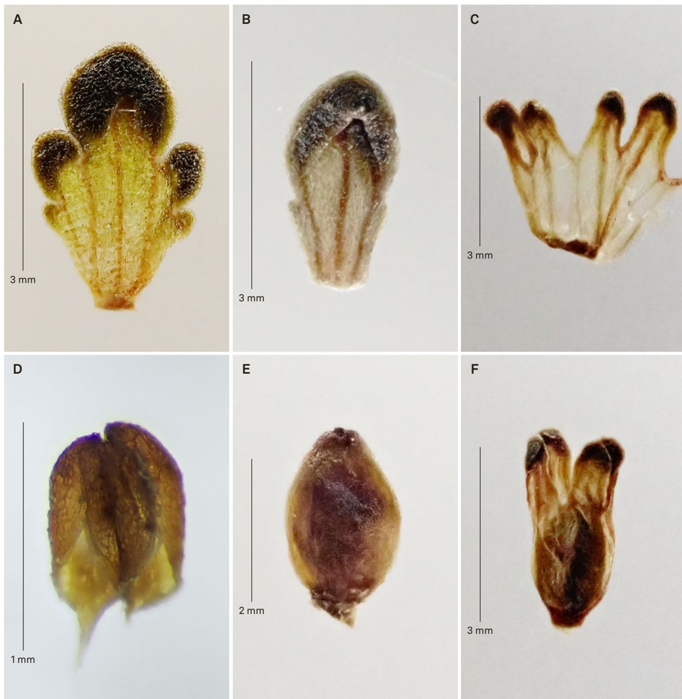
Fig. 3. – Euphrasia perpusilla Phil. A. Leaf of the third node; B. Leaf of the first node; C. Dissected calyx; D. Anthers; E. Immature capsule; F. Calyx. [Saldivia & Faúndez 4211]