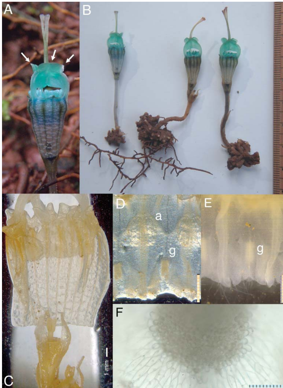
FIG. 2. Thismia betung-kerihunensis Tsukaya & H. Okada. A. Habitus. B. Three collected plants are shown. The thin root system observed under the middle individual does not belong to Thismia . The scale is in centimeters. C. Close-up of the flower preserved in 50% ethanol. The perianth tube was opened by a longitudinal slit. Note the absence of an acute apex in the anther connectives. Scale, 1 mm. D-E. Outer (abaxial) view of the anther connective. a, anther thecae; g, gland. Note the absence of acute apices and rectangular shape of the glands. Scale, 1 mm. Panel E shows the three-dimensional shape of the connectives and hairs from a specimen in 50% ethanol. F. Magnified image of the gland shown in panels D and E. Note the aggregates of round, nipple-like cells. Scale, 100 \mu m.