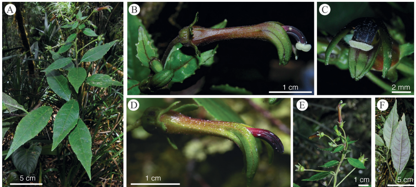
FIG. 2. Burmeistera monroi , photographs from field collections. A. Habit. B. Flower in female phase, lateral view. C. Flower in female phase, frontal view with detail of stigma and anthers. D. Flower in male phase, lateral view. E. Flowering branch with developing fruits. F. Abaxial leaf surface. All photos are of A. K. Monro 7142 except D, which is of A. K. Monro 6986.

from B. monroi by its hemi-epiphytic to epiphytic habit (versus terrestrial), glabrous corolla (versus sparsely to moderately pubescent), and oblong-ovoid berry (versus globose).