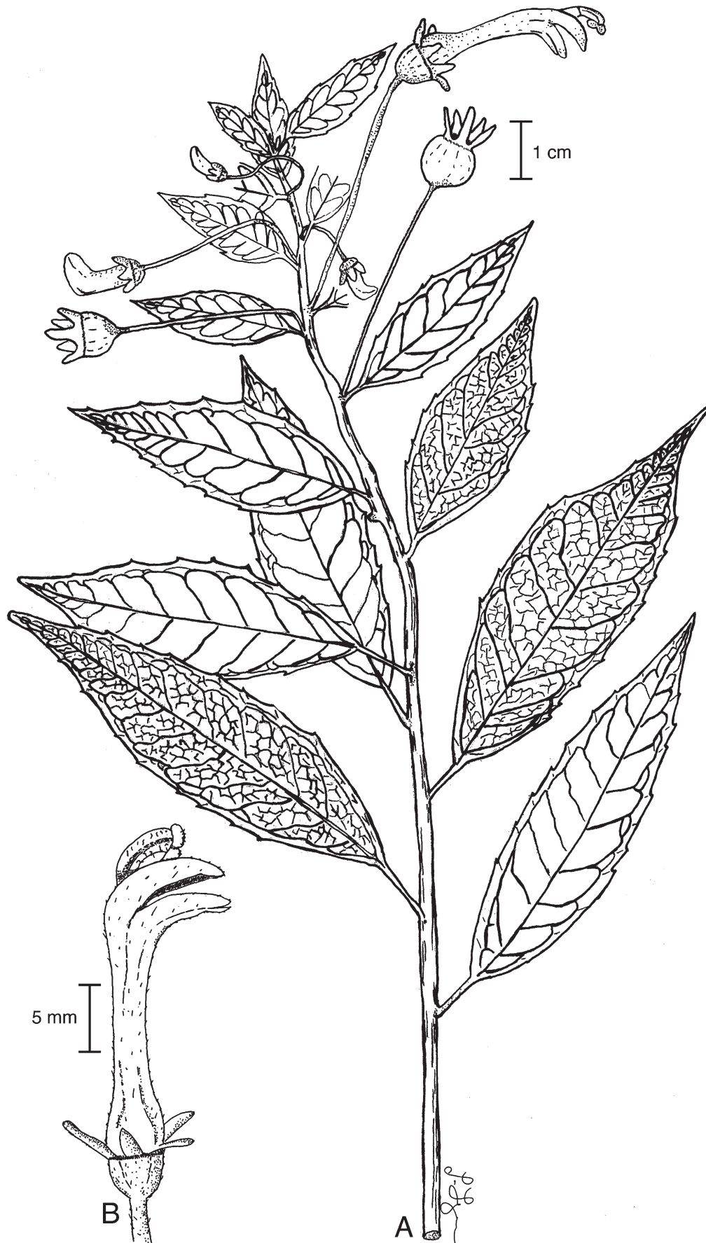
FIG. 1. Burmeistera monroi . A. Habit with flower buds, flower, and fruit. B. Flower in female phase. All drawings by L. Lagomarsino based on A. K. Monro 7142.