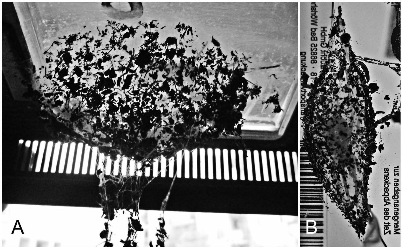
Figure 2.—Inhabited silken retreats of Viridasivus sp. from below, built in captivity. (A) subadult male kept on potting soil, (B) juvenile (body length ~13 mm) kept on coco humus and sand

Brescovit 2000, Zimmermann & Spence 1992). Ctenus medius Keyserling, 1891 was found during the day sitting under rocks and tree trunks, while wandering around at night (Almeida et al. 2000), similar to Phoneutria boliviensis (F. O. Pickard-Cambridge, 1897) (Hazzi 2014). Therefore, the herein described silken retreats of Viridasivus sp. are more similar to those found in several dionychan spider families, and corroborate the classification of Viridasiidae as members of the Dionycha (Polotow et al. 2015, Wheeler et al. 2017).