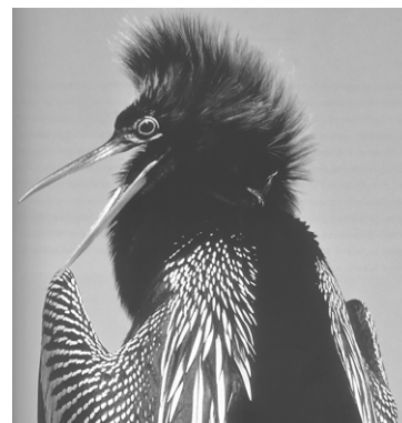
An anhinga